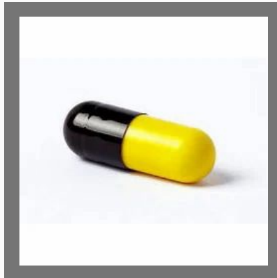
Grapessed Extract 25 mg Lycopene 2MG Capsules