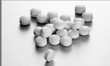
Ferrous Ascorbate 100mg Folic Acid 1.5mg Tablets