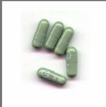
Zinc Gluconate with Prebiotic and Probiotic Capsules