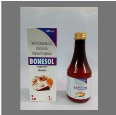
Bonesol Pharmaceutical Syrup