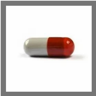
Lycopene 5000mcg Vitamin A5000 IU Vitamin C Capsules