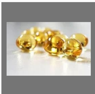
Vitamin A 1000 IU Vitamin E acetate 2.5 IU Capsules