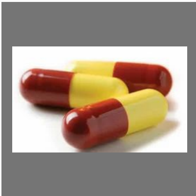
Ginseng Powder 42.5 Mg Vitamin A Acetate Capsules