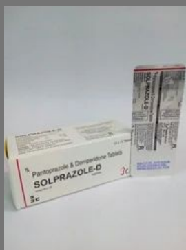
Solprazole D Tablets