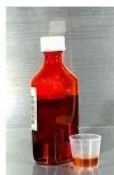
Ferrous Ascorbate Syrups