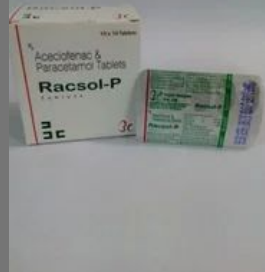
Racsol P Tablets