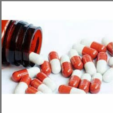
Phenylephrine HCl 2.5mg CPM 1 mg Paracetamol Capsules