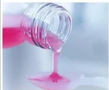
Calcium Carbonate 625 Mg Magnesium Hydroxide 180 Mg Syrup