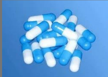
Paracetamol 125 mg Chlorpheniramine maleate 2 mg