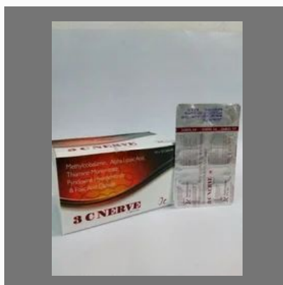
3 C Nerve Capsules