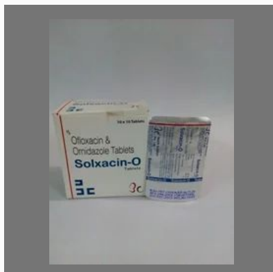
Solxacin O Tablets