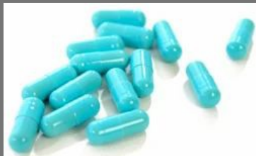
Paracetamol 250 mg Capsules