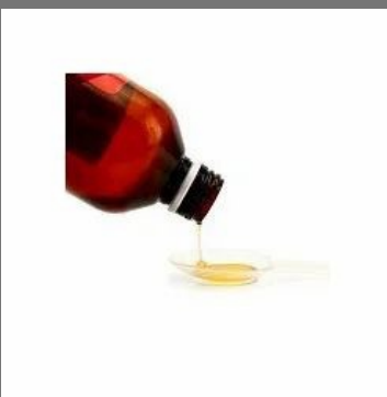
Multi Vitamin and Mineral Syrup