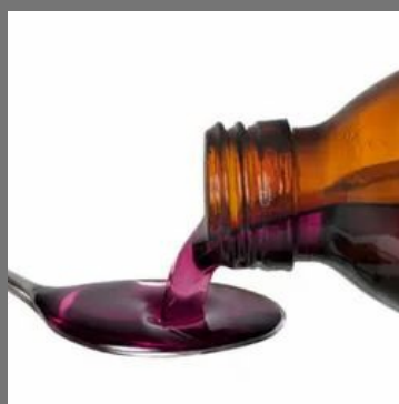
Haematinic with B-Complex Syrup