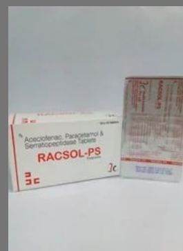
Racsol PS Tablets