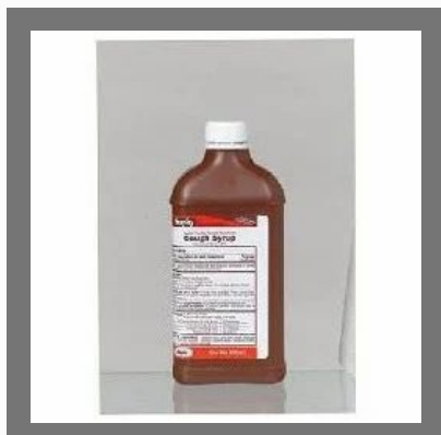
Fungal Diastase 50mg Pepsin 10mg Syrup