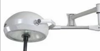
Wall Mounted Mobile OT Lights