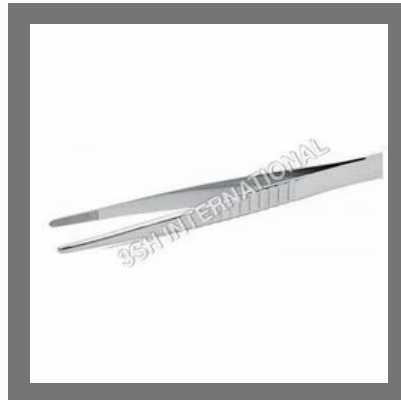
Non Toothed Surgical Dissecting Forceps