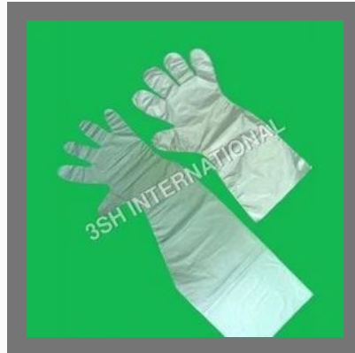
Veterinary Long Arm Sleeve Poly Gloves