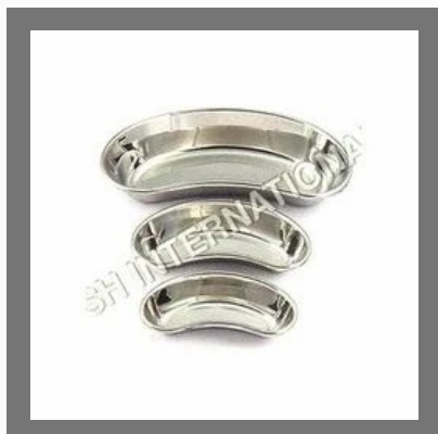
SS Kidney Tray