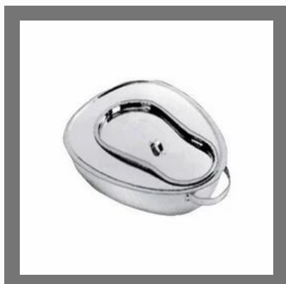
Females Urinals Holloware