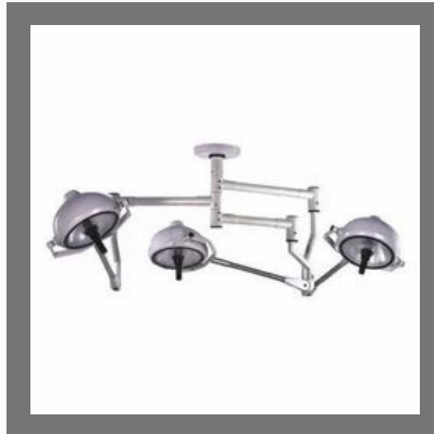
Three Dome Ceiling OT Lights