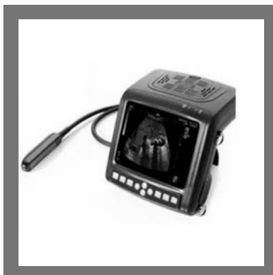
Veterinary Portable Wrist Ultrasound Scanner