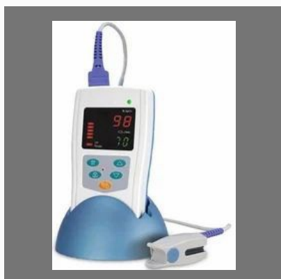
Veterinary Pulse Oximeters