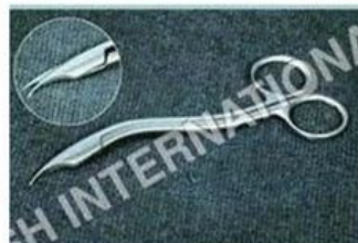
Stitch Cutting Scissor