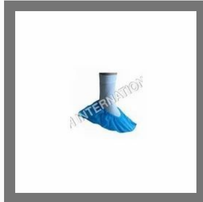
Disposable Elastic Shoe Cover