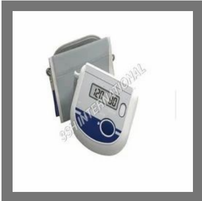
Medical BP Monitor