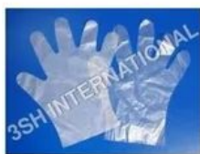
PE Plastic Gloves