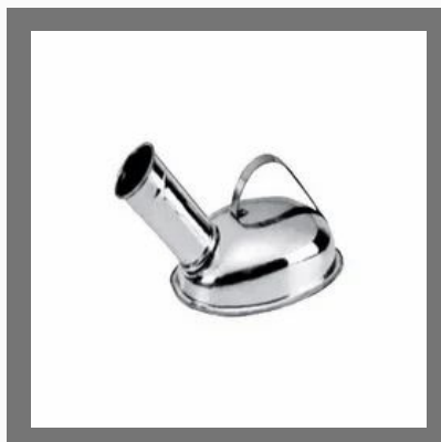
Male Urinals Holloware