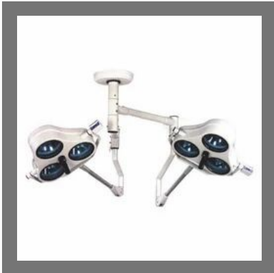
Double Dome Ceiling OT Lights