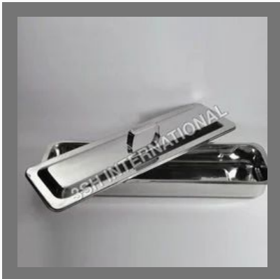
Stainless Steel Tray