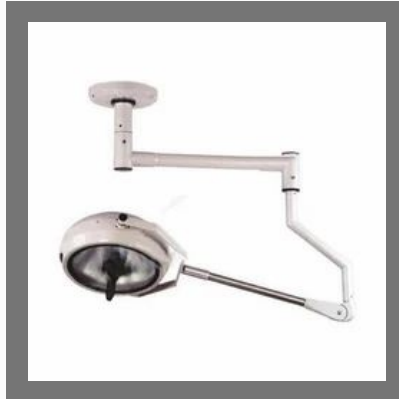
Single Dome Ceiling OT Lights