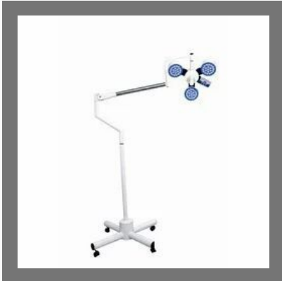
LED OT Lights