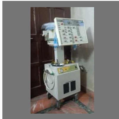
Siemens 300a Refurbished Ventilator