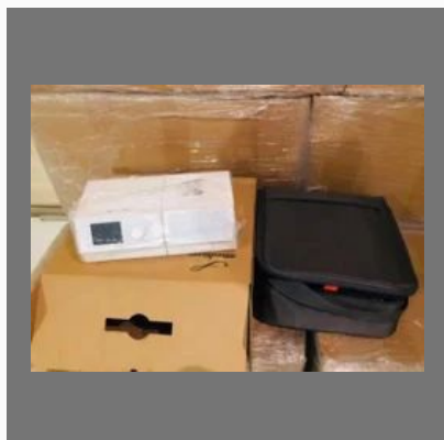
Used BiPAP Machine