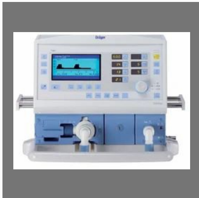
Drager Savina Ventilator