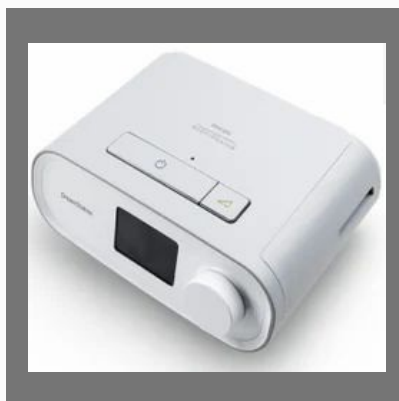
Philips Dreamstation Bipap Machine