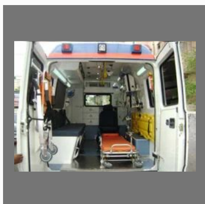
Ambulance Interior Fabrication