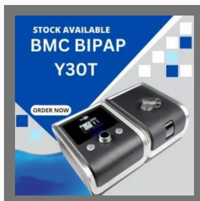
Bmc Bipap Machine