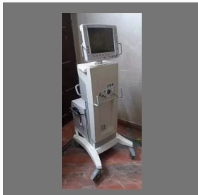
Icu Medical Ventilator