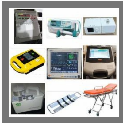
Medical Equipment Repair Services