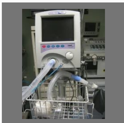
Portable Icu Ventilator