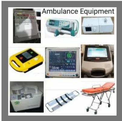
Medical Ambulance Equipment