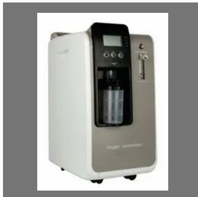
Medical Oxygen Concentrator