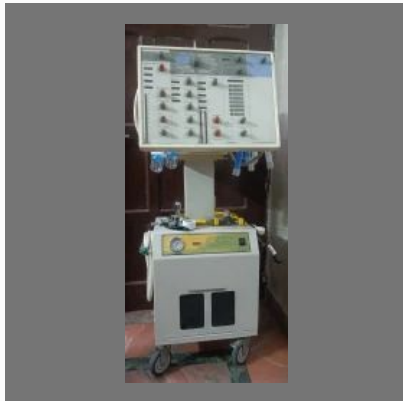
Medical Ventilator Repairing Services