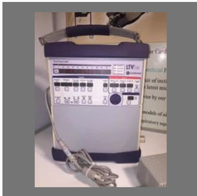
Transport Ventilator For Ambulance