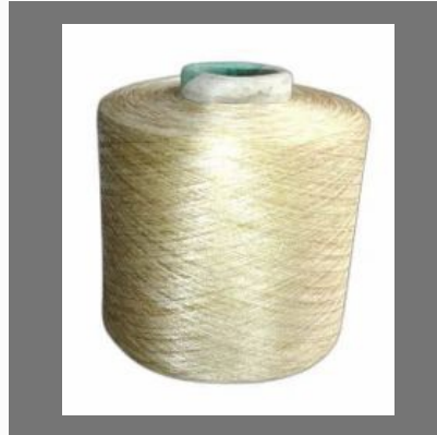
Polyester Viscose Yarn