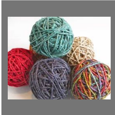
Cotton Fair Trade Spun Yarn