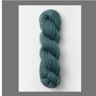
Jaspe Cotton Yarn