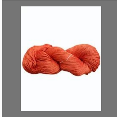
Viscose Wool Yarn