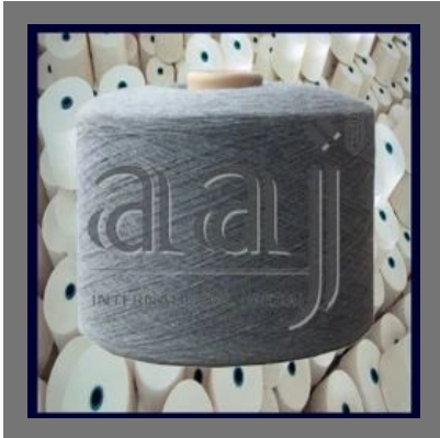
Ring Spun Yarn