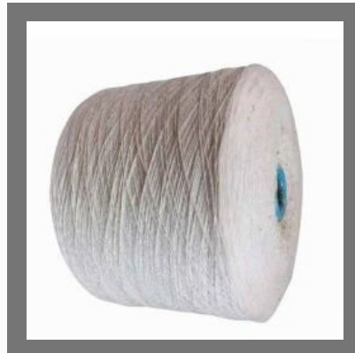
Core Spun Lycra Yarn