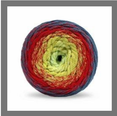
Magic Knitted Yarn