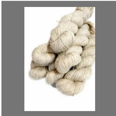
Cotton Organic Spun Yarn