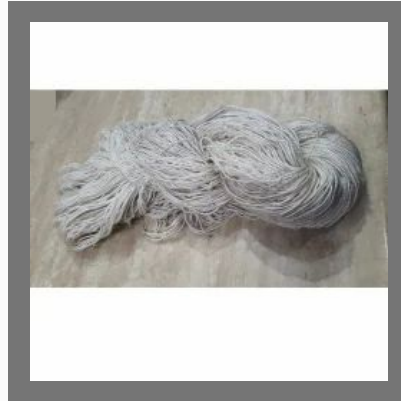
Viscose Linen Yarn