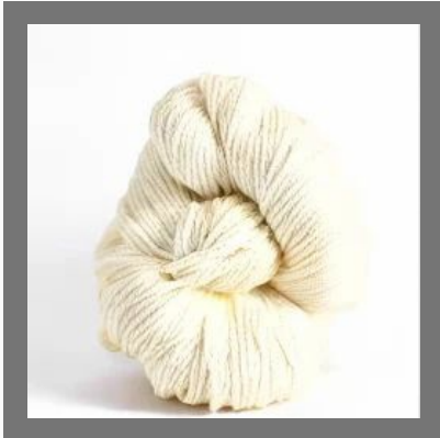
Cotton Modal Blended Yarn