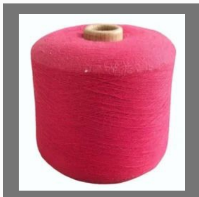
Dry Spun Yarn