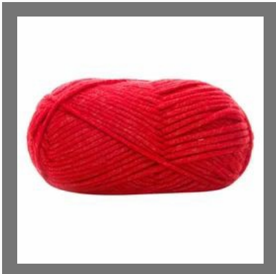
Poly Wool Yarn