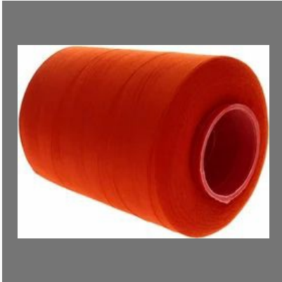
Red Viscose Yarn