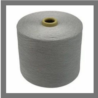
Modal Knitted Yarn