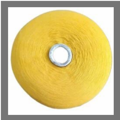
Melange Cotton Yarn