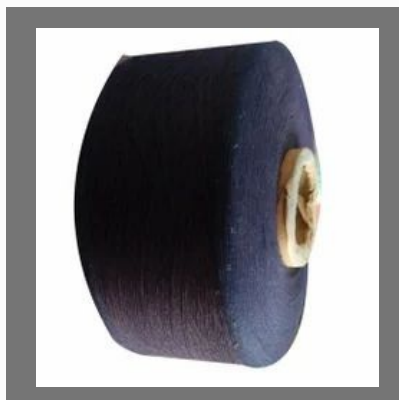
Polyester Cotton Yarn