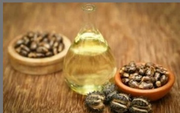
Castor Oil with Material