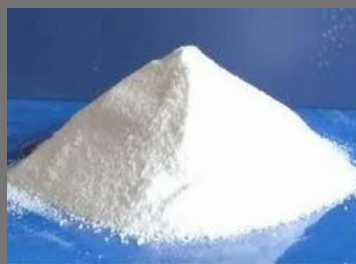
Pentaerithritol Rubber Chemicals