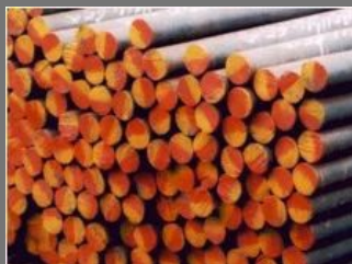
Alloy Steel Rounds