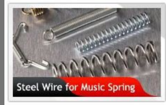
Steel Wire For Music Spring