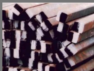
Alloy Steel Squares