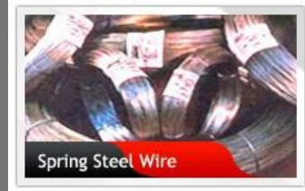
Spring Steel Wire