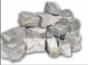
Ferro Chrome HC, FeCrH.C.