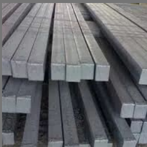
Carbon & Alloy Steel Billets