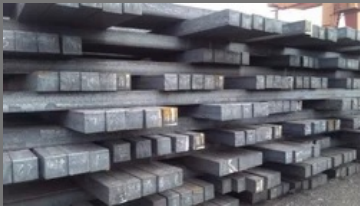
Arti Steel Billet