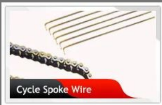
Cycle Spoke Wire