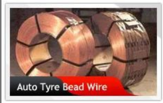
Auto Tyre Bead Wire