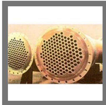
Water Cooled Condenser