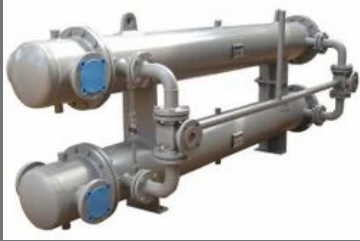
Duplex Lube Oil Cooler