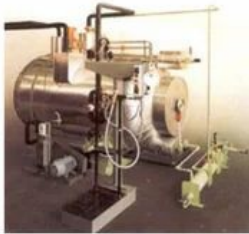
Liquid CO2 Storage Vessel