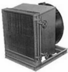
Air Cooled Oil Cooler