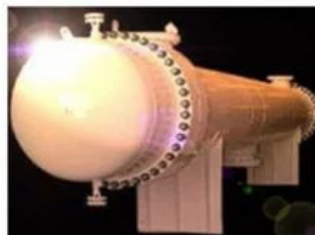
Tube Heat Exchanger