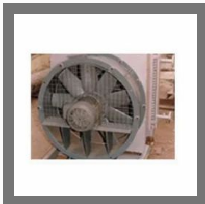
Air Cooled Condenser