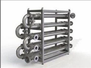
Sludge Heat Exchanger