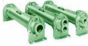
Water Cooled Oil Cooler