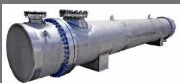
Industrial Heat Exchanger