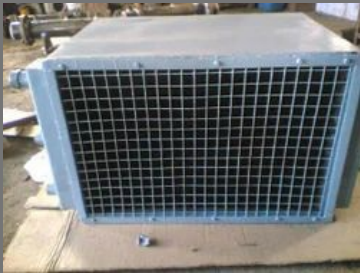
Air Cooled Heat Exchanger