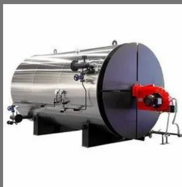
Fuel Oil Suction Heaters