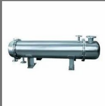
Shell and Tube Type Condensers