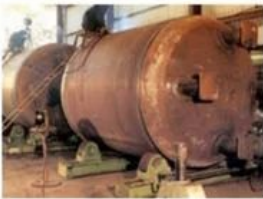
Chemical Storage Vessel