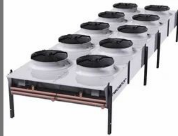
Air Cooled Condensor