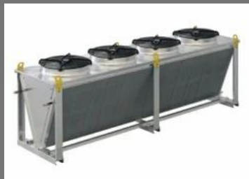
Air Cooled Condensor