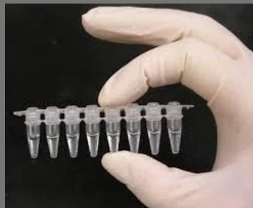
Pcr Testing Services