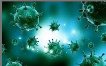
Molecular Diagnostic Services