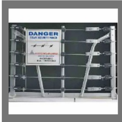
Solar Security Fencing System