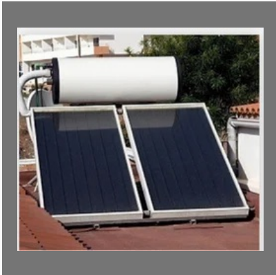
Solar Water Heater