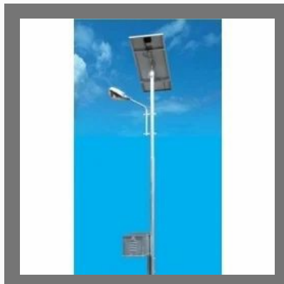
Solar CFL Street Lighting House