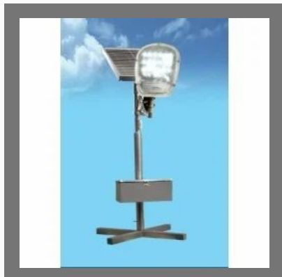
Solar LED Street Lighting System