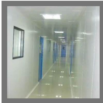
Modular Panels For Corridor