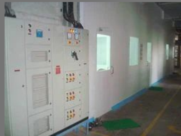
Clean Room Equipment