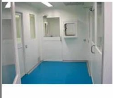
Vertical Flow Clean Rooms