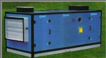
HVAC For Pharmaceutical & Hospital