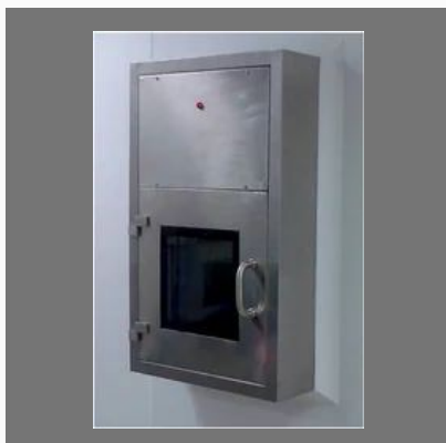
Dynamic Pass Box