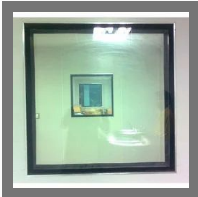
Double Glazed View Panel