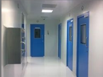
HVAC & Cleanrooms Allied Items