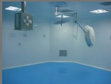
Turnkey Solution for Pharmaceuticals