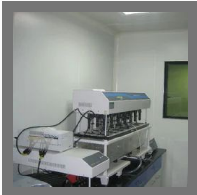
Modular Panels For Laboratory