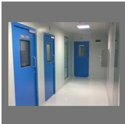
Clean Room Doors