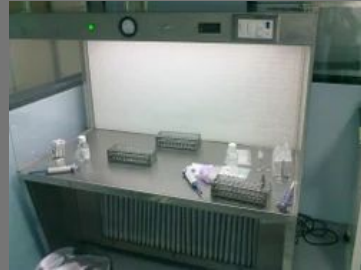
Laminar Air Flow (Lab Model)