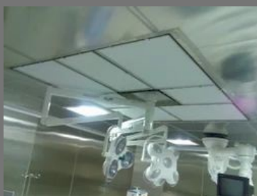
Turnkey Solution For Operation Theaters