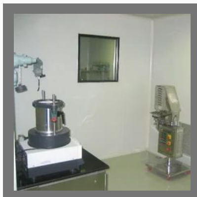
Modular Panels For R & D