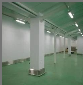
Turnkey Solution for Clean Rooms