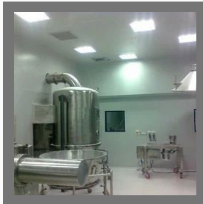
Modular Panels For Processing Areas