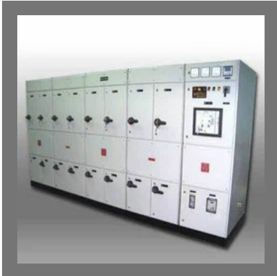
Fixed Power Control Centre