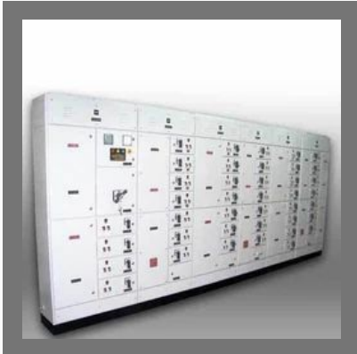
Intelligent Motor Control Centre