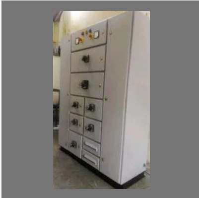
Electric Controller Panel