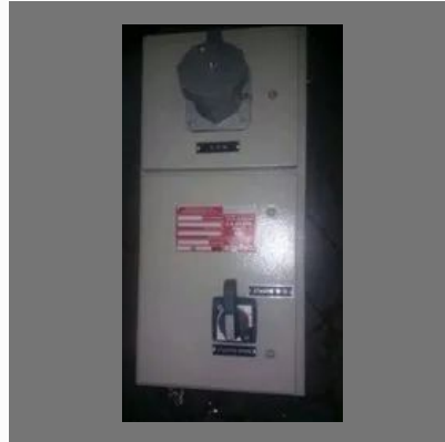
Electric Main Switch Panel