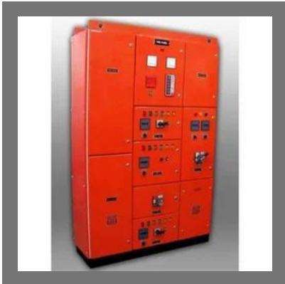
Fire Fighting Panel (Hydrant)