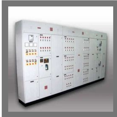
Fixed Motor Control Centre