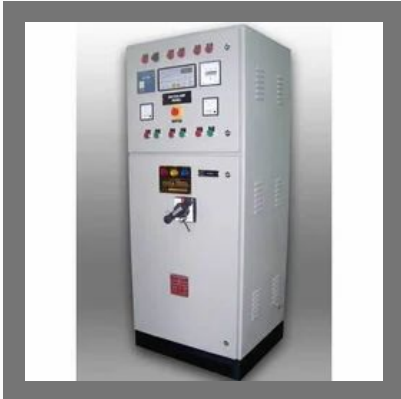
AMF Panel - Only D.G. Control