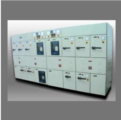
D.G Synchronisation using PLC logic