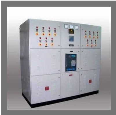
Intelligent APFC panel- Thyristor Switching