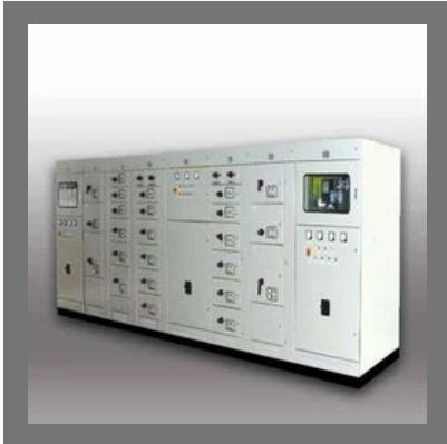
Drawout Motor Control Centre