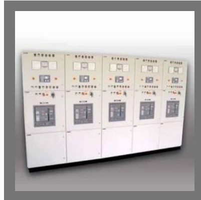
D.G Synchronisation using Controllers