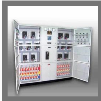
Intelligent APFC Panel(Contactor Switching)