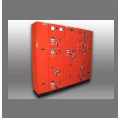
Fire Fighting Panel (Hydrant and Sprinkler)