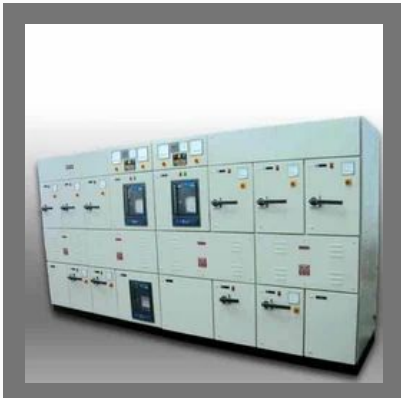
Intelligent Power Control Centre