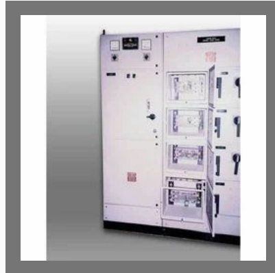
Drawout Power Control Centre