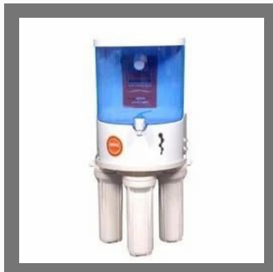
Astro Water Purifier