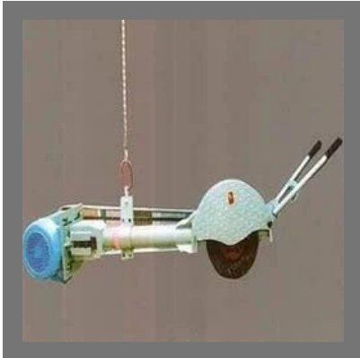
Astroman Swing Frame Grinding Machine