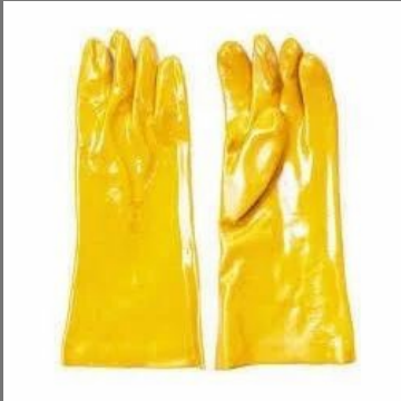
Astroman PVC Gloves