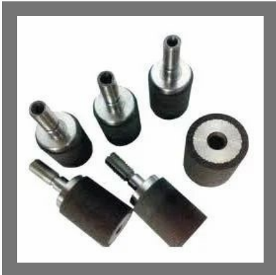
Mounted Points Grinding Wheel