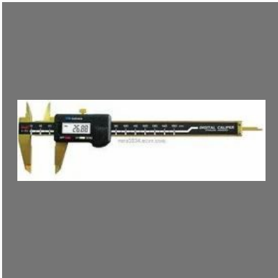
Digital Vernier Caliper