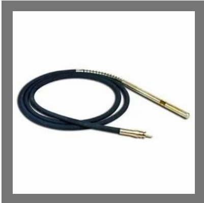
Astroman Product Concrete Vibrator