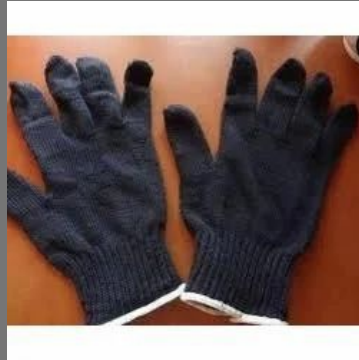
Cotton Safety Gloves