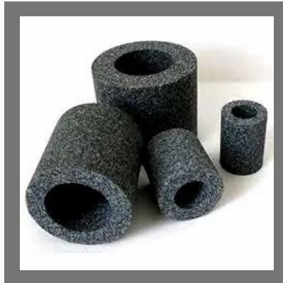
Steel Foundry Internal Grinding Wheel