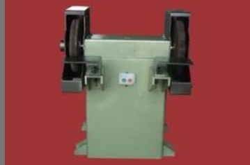
Astroman Pedestal Grinding Machine