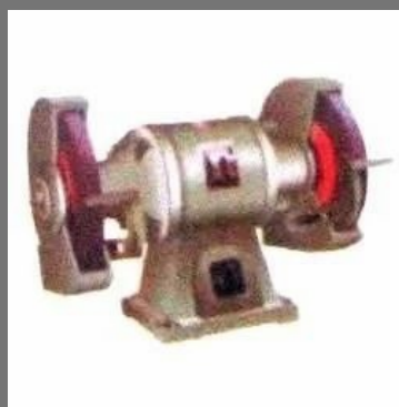
Bench Grinding Machine