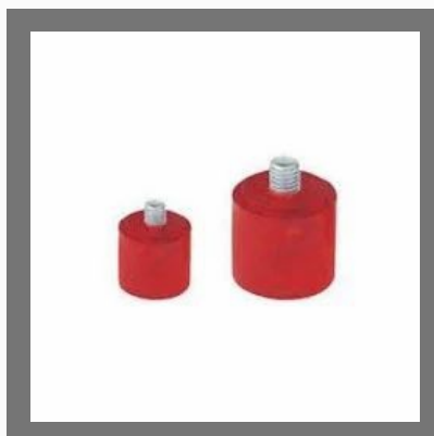
Astroman Nylon Hammer Mallets