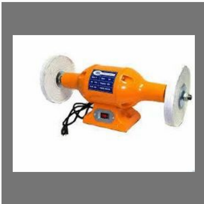
Buffing Grinding Machine