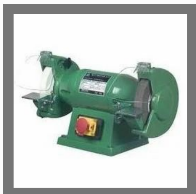
Bench Grinding Machine