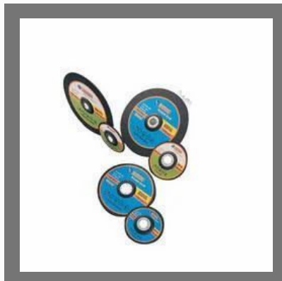
Fabrication Grinding Wheel