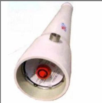
RO Housing (Make Turbo)