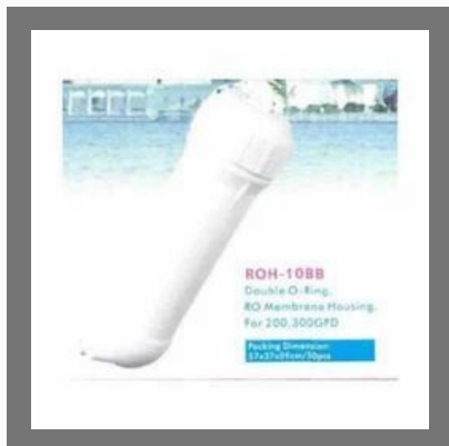
RO Membrane Housing