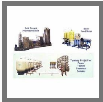
Industrial RO Systems