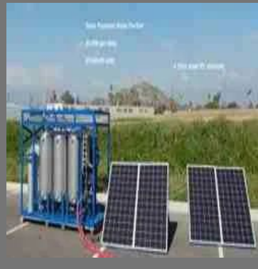
Solar Water Treatment Systems