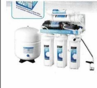
RO Water Purifier