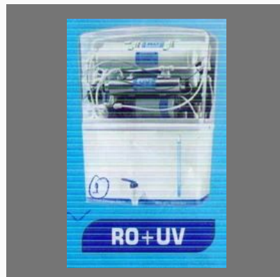
RO Alkaline Water Purifiers