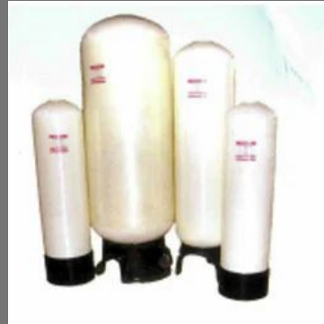
FRP Vessels (Acros)