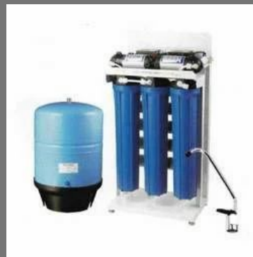
Reverse Osmosis Water Purifier