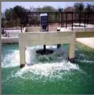
Sewage Treatment Plants