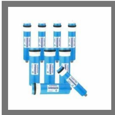
Hidrotek RO Membrane