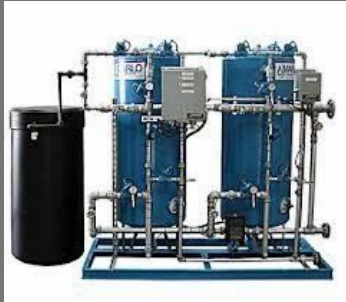
Water Purification Systems