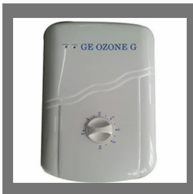
Ozone Water Purifier