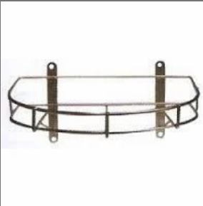
RO Water Purifier Stand