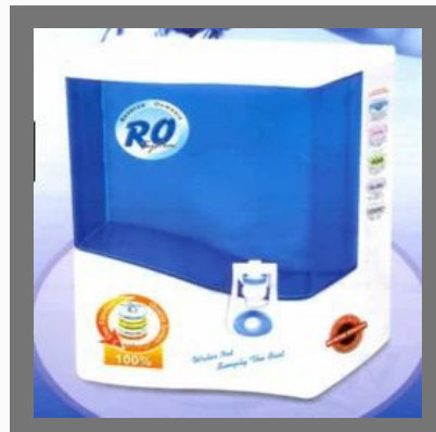
Reverse Osmosis Water Purifier