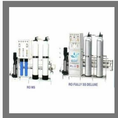
Package Drinking Water Treatment Plant