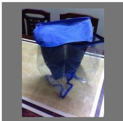
Ro Water Purifier Cover