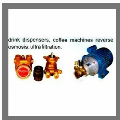
Procon Pumps Parts