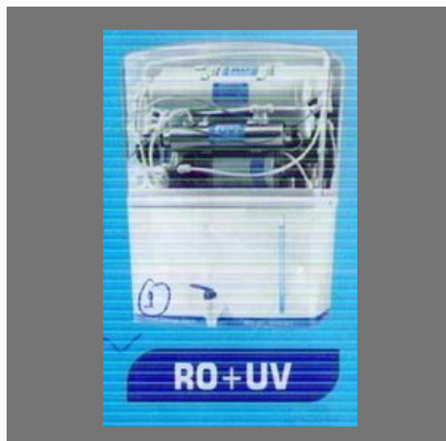
5-Stage RO Water Purifier UV UF