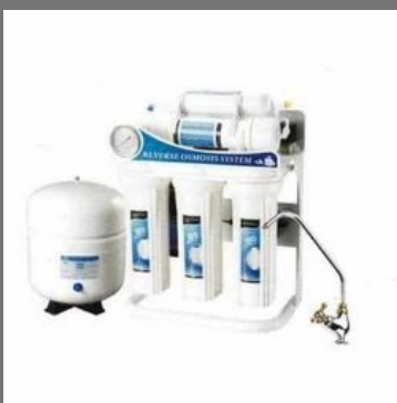
Auto Flush RO System