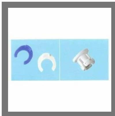
RO Quick Fittings