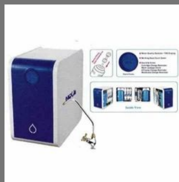
Ro With UV Water Purifier