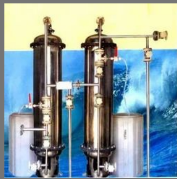
Two Bed Upflow Deioniser(D.M Water Plant)