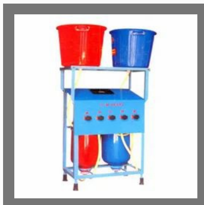
Standard Portable De-Ionisers(D.M Water Plant)