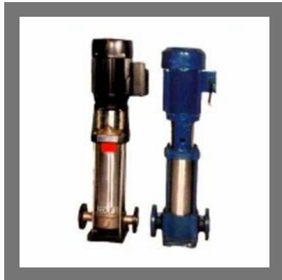
High Pressure Pumps