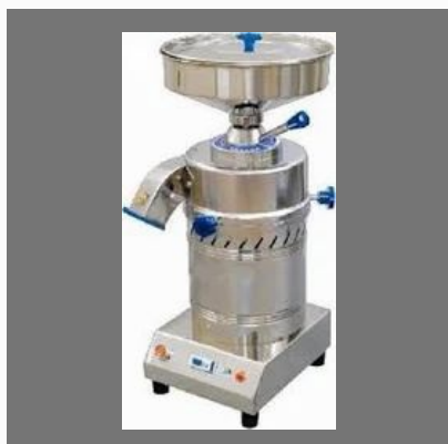
SS Ghar Ghanti