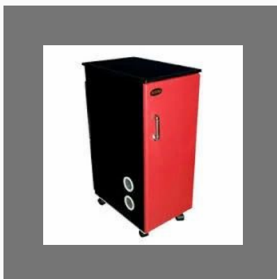
Wooden Ghar Ghanti Flour Mill