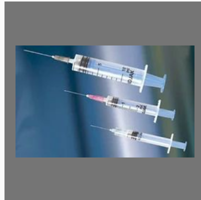
Auto Disable Syringes