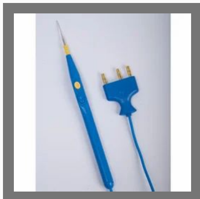
Disposable Cautery Pencil