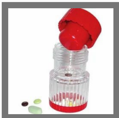
Pill Tablet Crusher