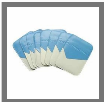
Dental X Ray Film