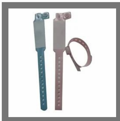
Patient Identification Bands