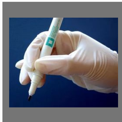
Skin Marker Pen