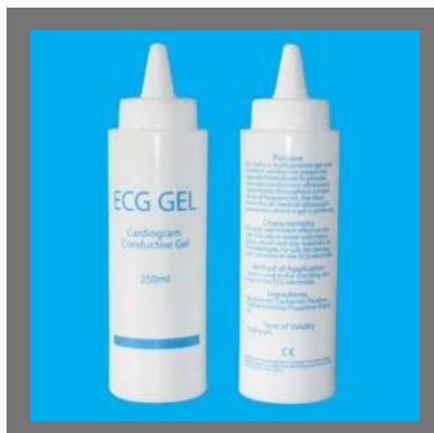
Ecg Ultrasound Gel