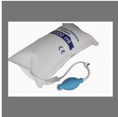
Pressure Infuser Bag