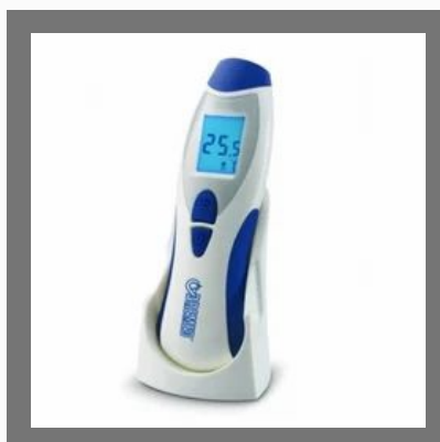
Non Contact Thermometer