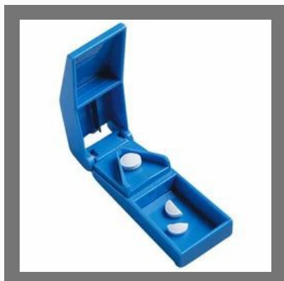
Tablet Cutter/ Pill Cutter