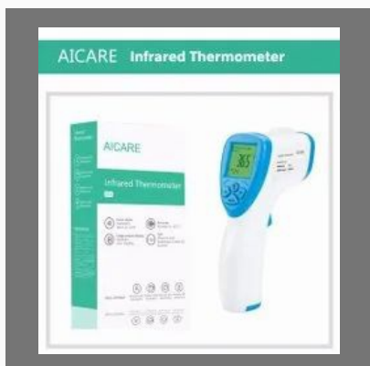
Non Contact Infrared Thermometer