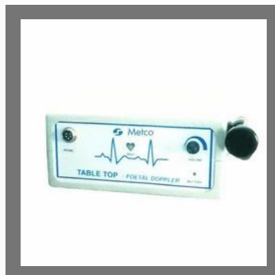
Table Top Fetal Doppler