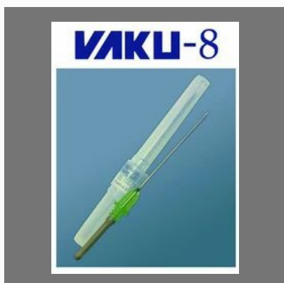
Blood Collection Needle