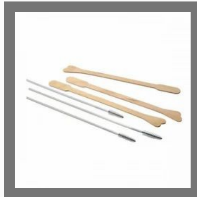
Cytobrush Endocervical Brush