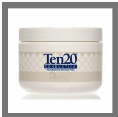
Ten 20 EEG Paste