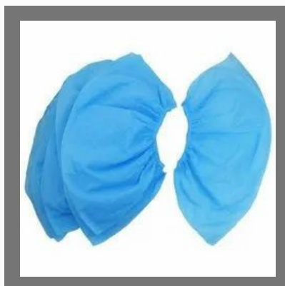
Non Woven Shoe Cover