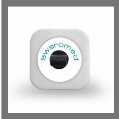
Swaromed ECG Electrode