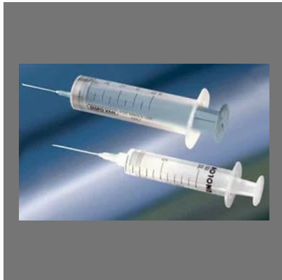
Dispovan Disposable Syringe