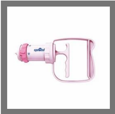
Manual Breast Pump