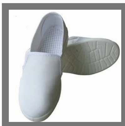
Anti Static Shoes