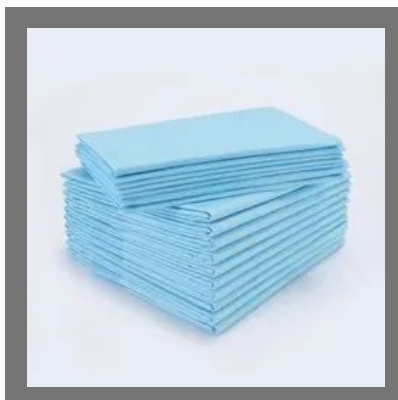
Disposable Under Pad