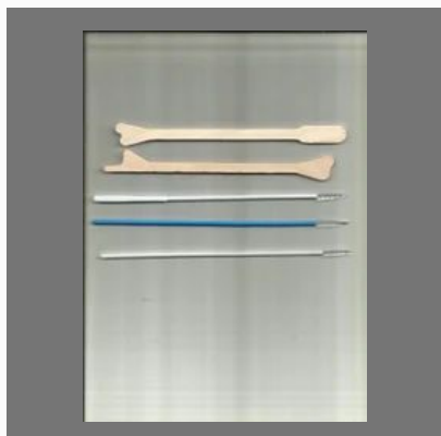
Pap Smear Kit