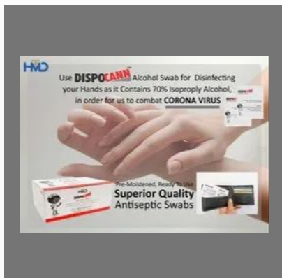
Dispocann Alcohol Swab