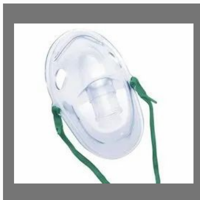
Nebulizer Soft Mask