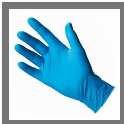
Nitrile Latex Examination Gloves