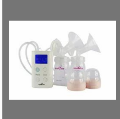
Electric Breast Pump