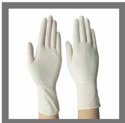
Latex Examination Gloves