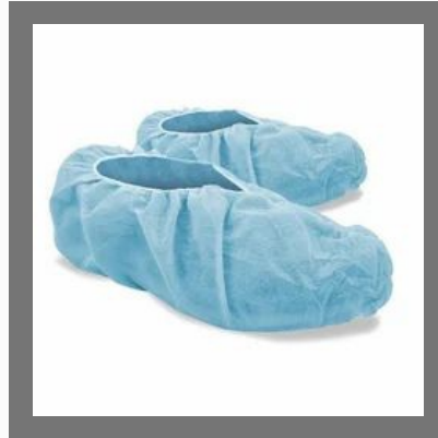
Disposable Shoe Covers