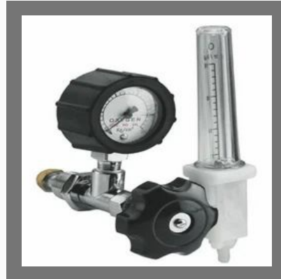
FA Valve Humidifier Bottle