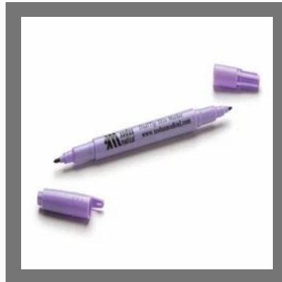
Dual Tip Skin Marker Pen