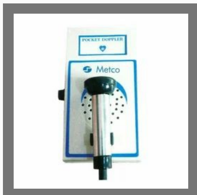
Pocket Fetal Doppler