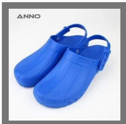
Clean Room Shoes