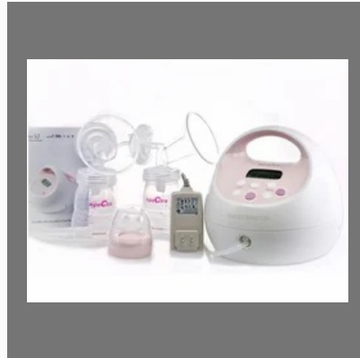
Spectra Electric Breast Pump S-2