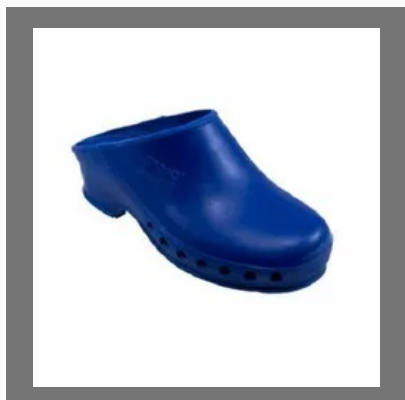
Cleanroom Safety Shoes