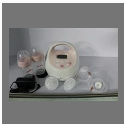
Spectra Electric Breast Pump S-2 Plus