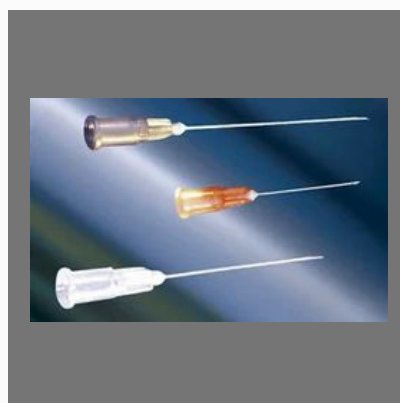
Disposable Syringe Needle