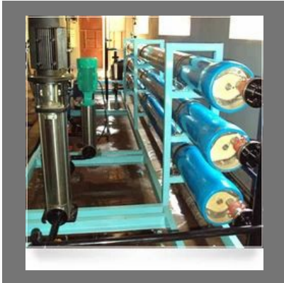
Tannery Effluent Treatment & Recycling Technologies Service