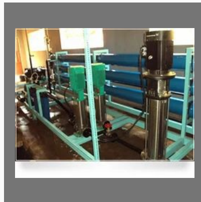
Oil Refinery Waste Water Treatment Service