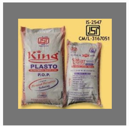
Ready Mix Plaster