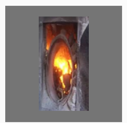
Joint Finish Compound