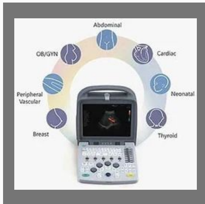
Color Ultrasound Services