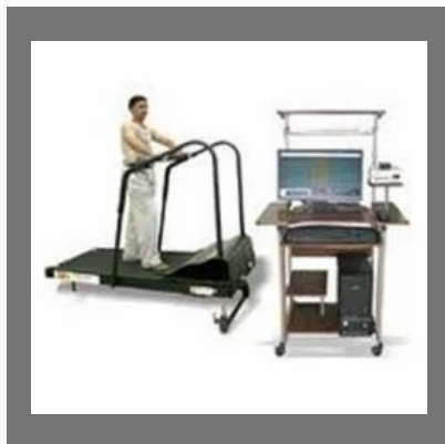
T M T Services