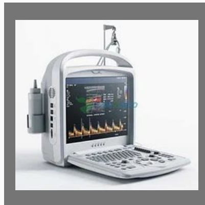
Color Echo Services