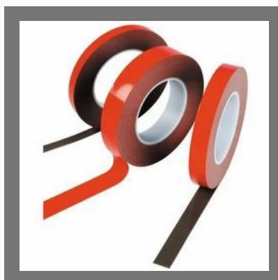
Double Sided Acrylic Foam Tape