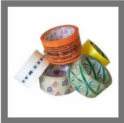
Printed Bopp Packing Tape