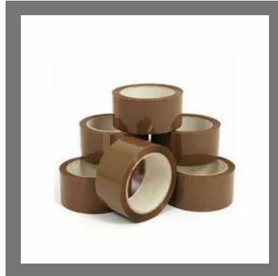
Plane Bopp Packing Tape