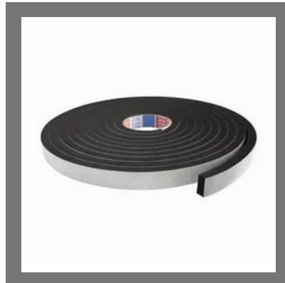
Single Sided Foam Tape