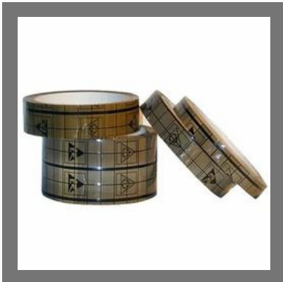
Conductive Grid Tape