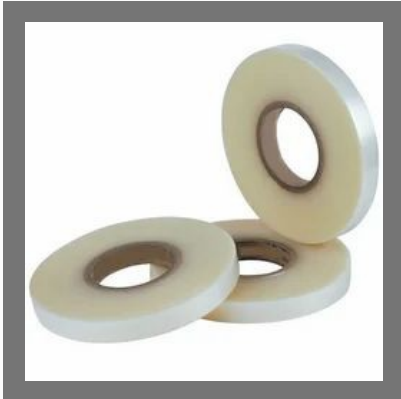
Seam Sealing Tape