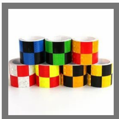
Electrical Insulation Tape