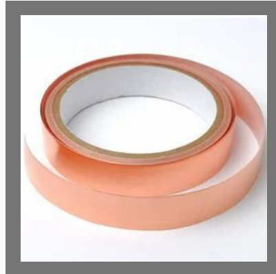
Copper Foil Tape