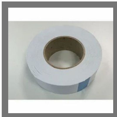
Solvent Double Sided Tissue Tape