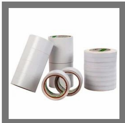
Double Sided Tissue Tape