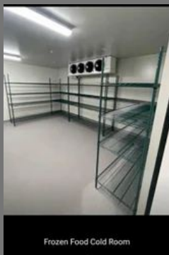
Banana Ripening Chamber and Cold Room