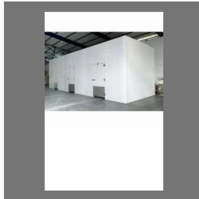
Commercial Cold Storage