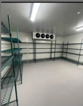
Cold Storage Chamber