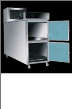
Mortuary Cabinets Chambers