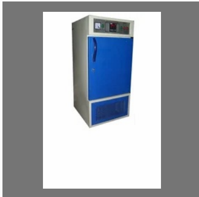
Lab Bod Incubator