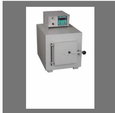
High Temperature Muffle Furnace