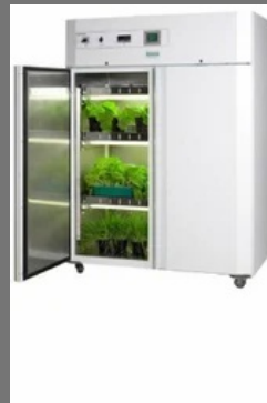
Plant Growth Chambers