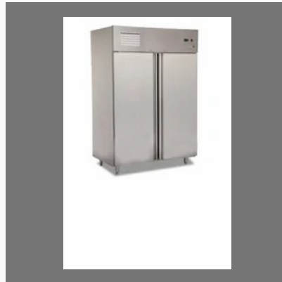
Ultra Low Temperature Freezer