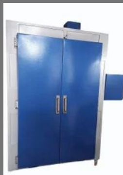
Hot Air Oven Machine