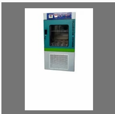
Bod Incubator Shaker