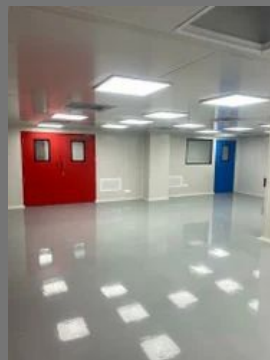
Modular Clean rooms