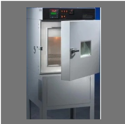
Humidity Test Chamber