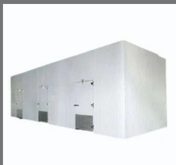
Portable Cold Storage Rooms