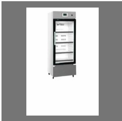
Medical Pharmaceutical Refrigerator