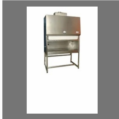
Bio Safety Cabinet