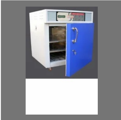
Laboratory Heating Oven