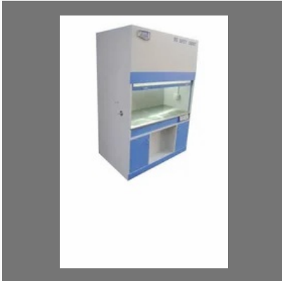
Biosafety Cabinet Class II