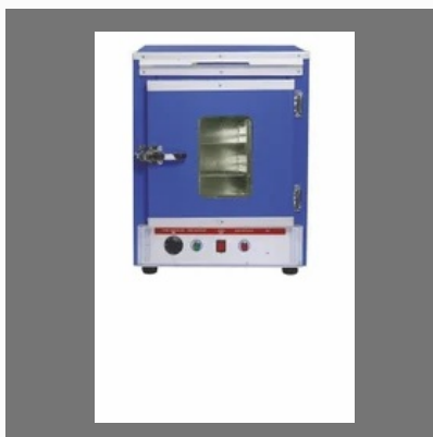
Laboratory Bod Incubator