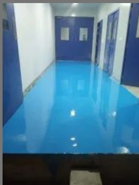
Clean Room Doors