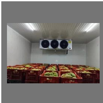
Cold Room Cold Storage