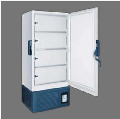
Blood Bank Refrigerator