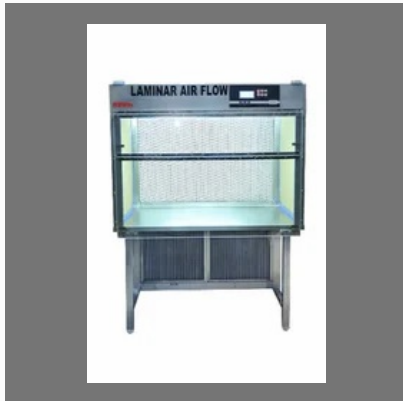
Horizontal Laminar Airflow