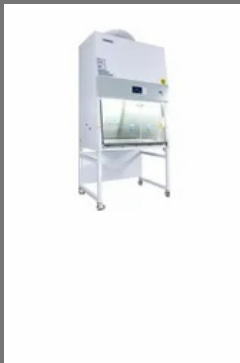
Steel Biosafety Chamber