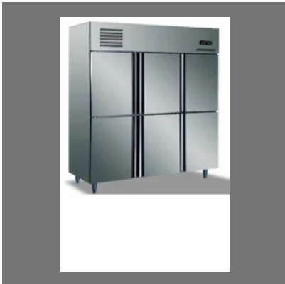
Industrial Deep Freezer