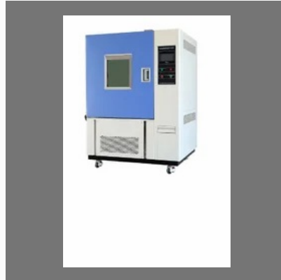
Humidity Chamber Machine