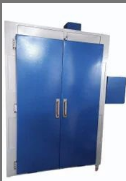
Core Heating Oven