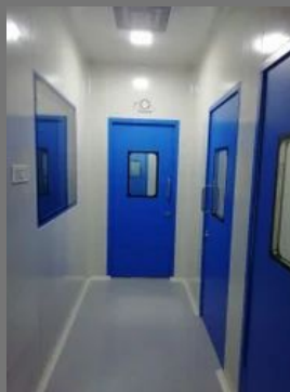
Clean Room Doors