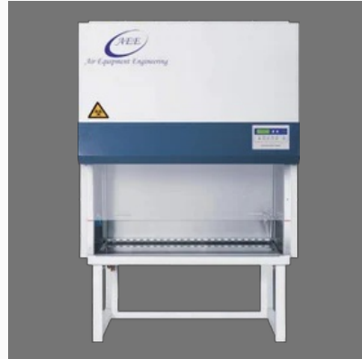
Laminar Air Flow Cabinets