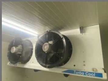
Cold Room Refrigeration Unit