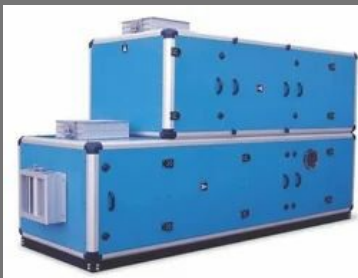
Double Skin Air Handling Units