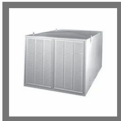
Industrial Air Conditioners