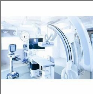
Modular Operation Theater