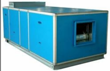
Single Skin Air Handling Units