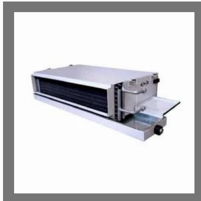
Industrial Fan Coil Units