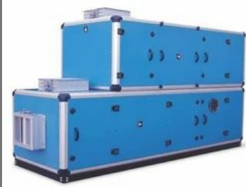
Air Handling Unit System