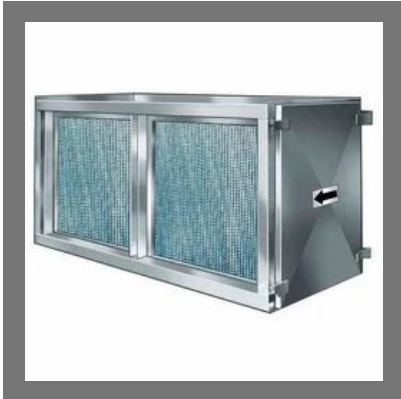
HEPA Filter Housing Boxes