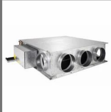
Fan Coil Unit