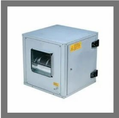
Horizontal Fan Coil Units