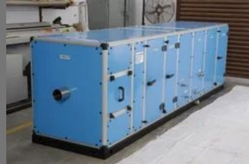
Air Handling Unit