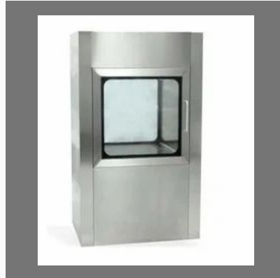
Dynamic Pass Boxes