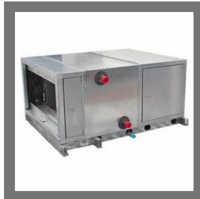
Industrial Air Handlers