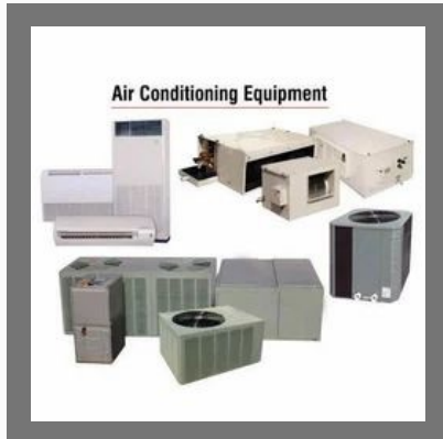
Air Conditioning Equipment