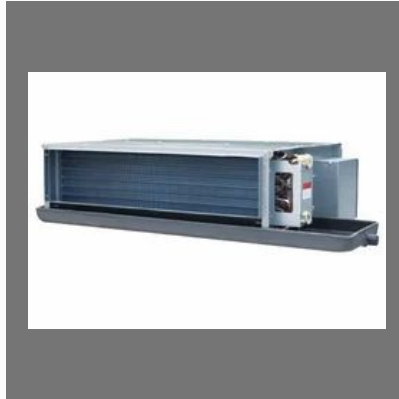
Horizontal Fan Coils