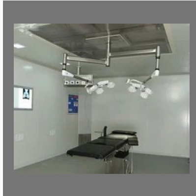
PPGI Modular Operation Theaters