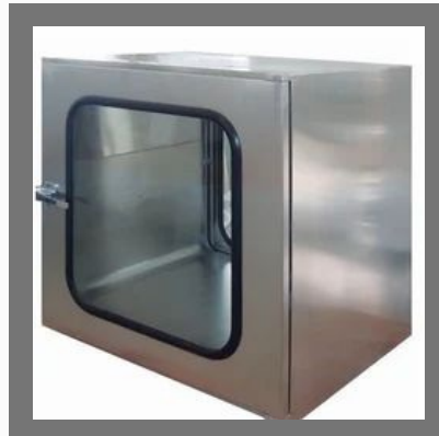
Static Pass Box