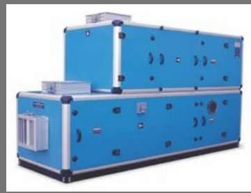
Air Handling Equipment