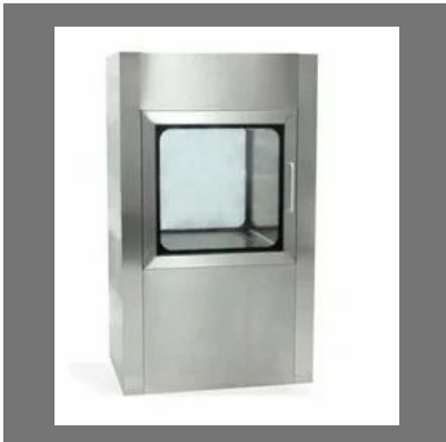
Dynamic Pass Box