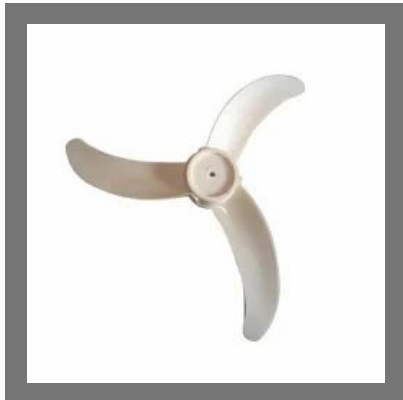
16 Inches Bullet Fan Blade