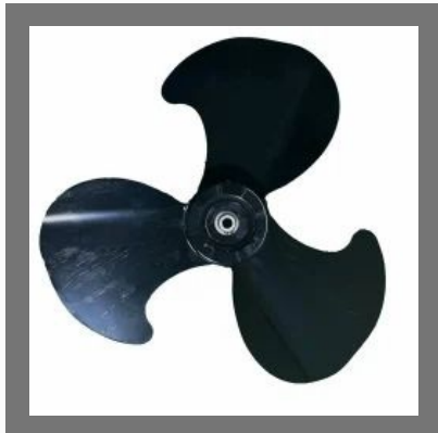
18" Symphony Type Cut Bore Size 2.5 Sut Blade