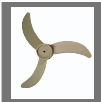
16" ABS Bullet Blade With Bush