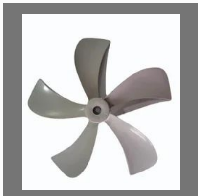
16" Cyclone Blade (ABS)