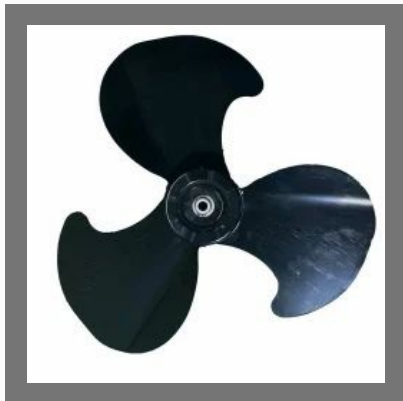
16" Symphony Type Blade