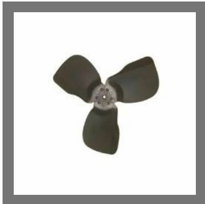
12" 3 Leaf Blade