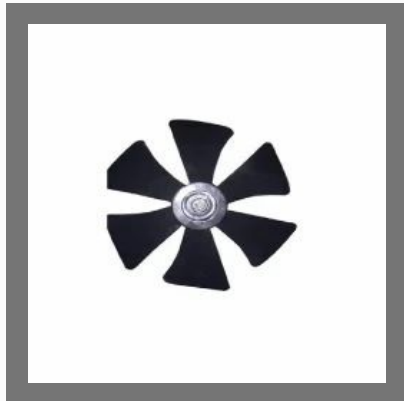
Baltra Cooler Cut Blade 2.5 Sut