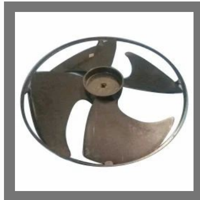
18" Symphony Type Ring 4 Leaf Blade