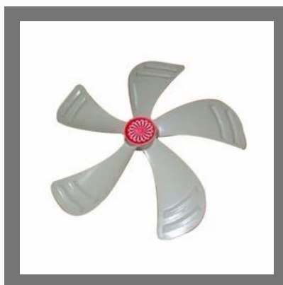
Hurricane Fan Blade