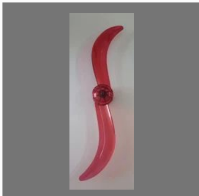
Farata Fan Blade PLATINUM