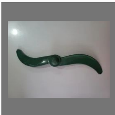
Padestal Fan Blade