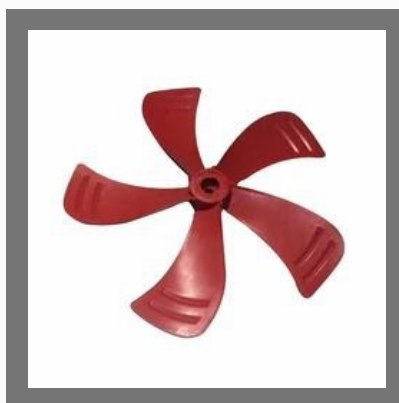
Hurricane Blade Color