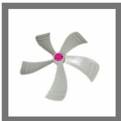
Hurricane Heavy Fan Blade