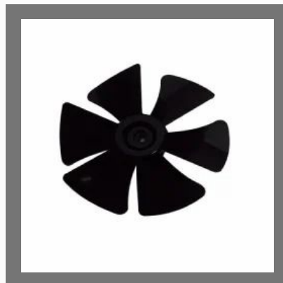
14" Velocity Blade