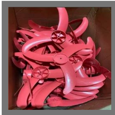
18" Fratta Blade Speed