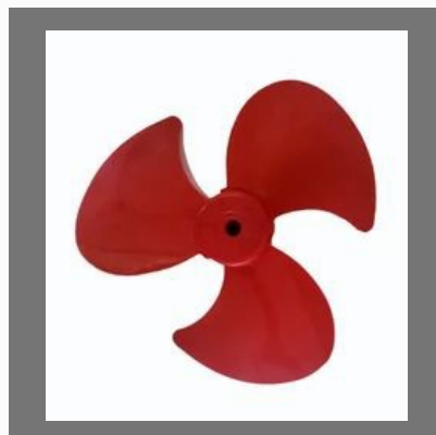
12" High Speed Blade