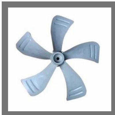
Hurricane Light Fan Blade