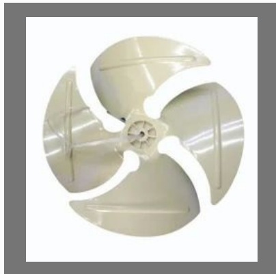
16" Climatizer Blade