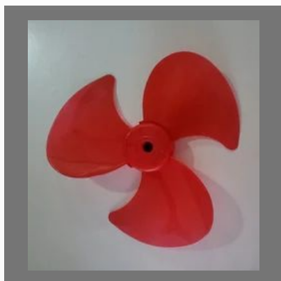
6" High Speed Blade