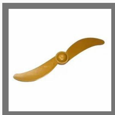
Farata Fan Blade