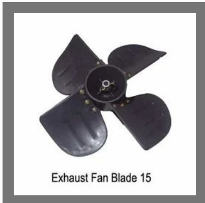
Exhaust Fan Blade