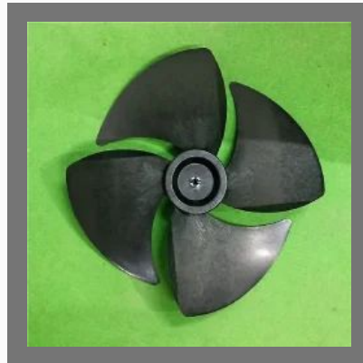
19" Commercial Cooler Blade