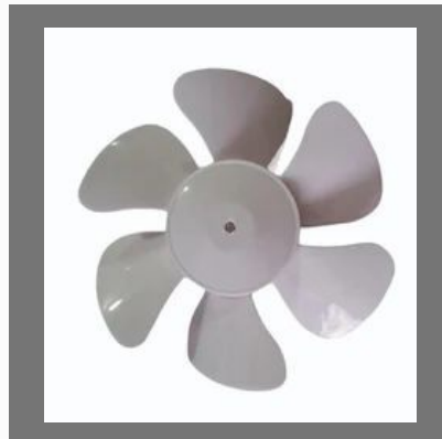
6" Ventilation Blade