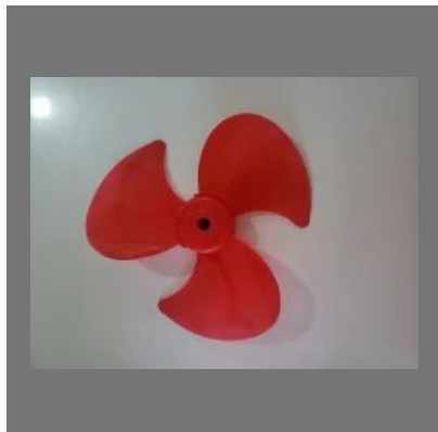
Hss Hacksaw Blade