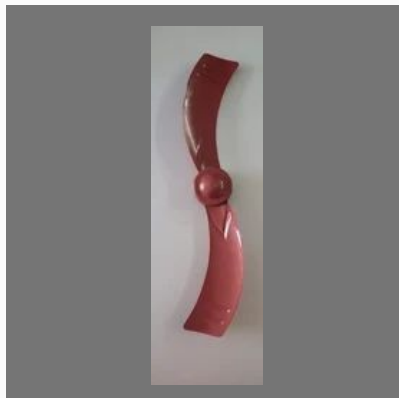
16" Farata Fan Blade