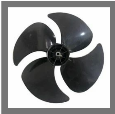
14" Kauva Blade