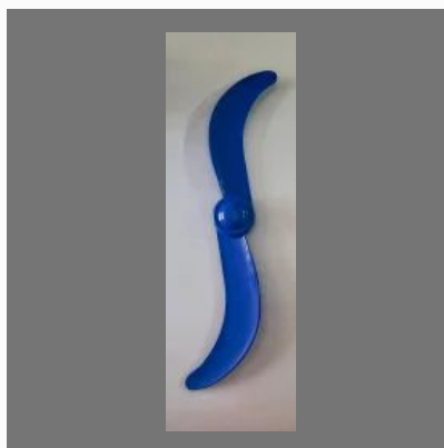
Farata Fan Blade V.S