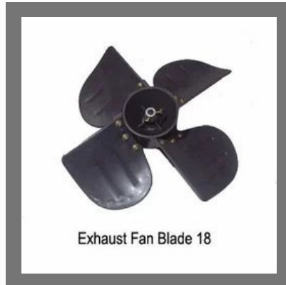
Exhaust Fan Blade