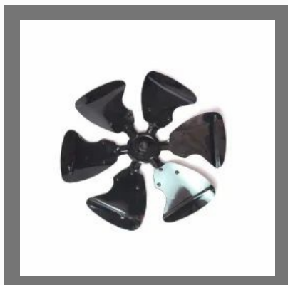
18" Typhoon Blade