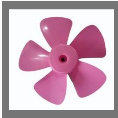
12" Fresh Air Fan Blade