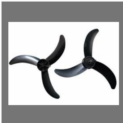
16" Bullet Blade