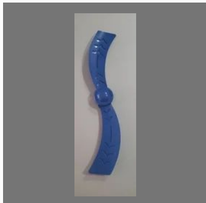
Farata Fan Blade Hurricane Gold