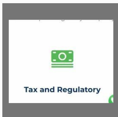
Tax And Regulatory Services