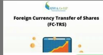
Foreign Currency Transfer Services