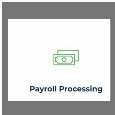
Payroll Processing Service