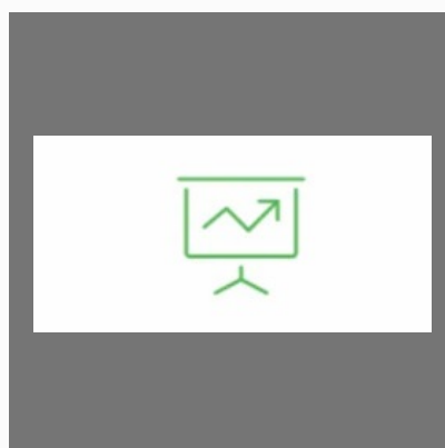
Company Formation services & FDI