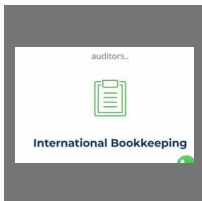
International Bookkeeping Services