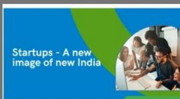
Business Startup Services