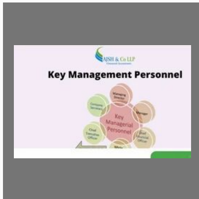
Key Management Personnel