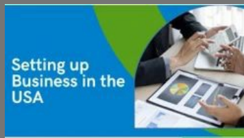
Setting up business in USA