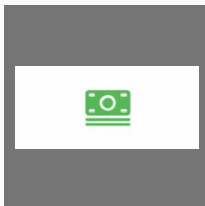
Tax and Regulatory