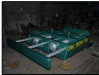
Double Screw Rods Pusher Furnace