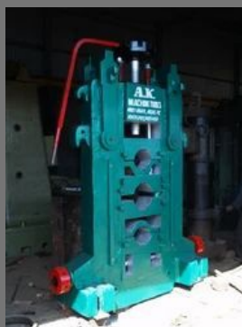
Rolling Mill Stand Center Jamed