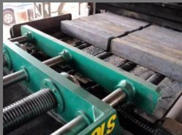
Pusher Pushing The Billets In Furnaces