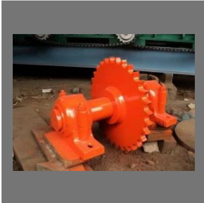
Chain Sprocket Shifter System