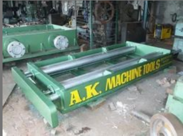
Pneumatic And Hydraulic Furnace Pusher