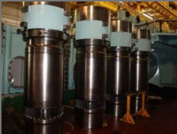
Marine Engine Cylinders