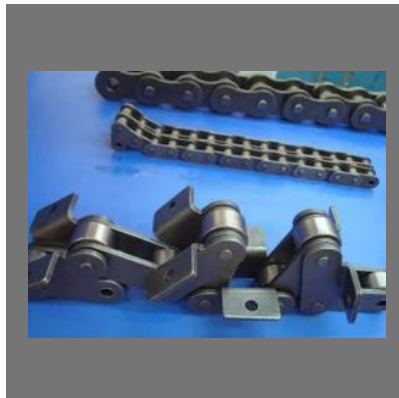
Cooling Bed Chains