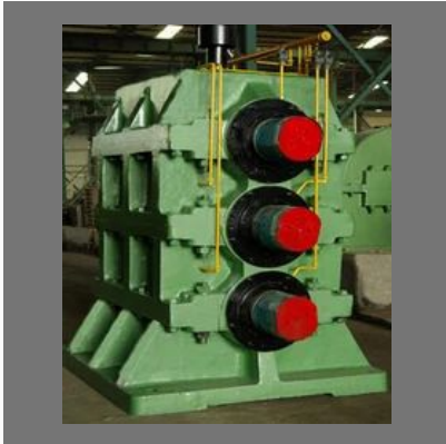
Pinion Gear Boxes