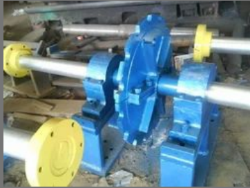
Cooling Bed Systems