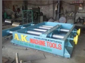
Furnace Double Screw Rods Pusher