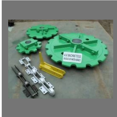
Cooling Bed System Chain Sprockets