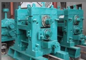
Rolling Mill Stands Bearing Type