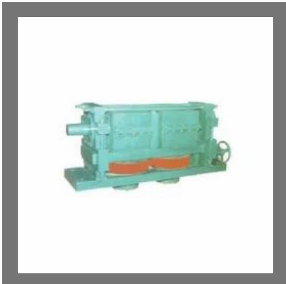
Rolling Mill Vertical Stands