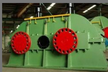
Reduction Gear Boxes