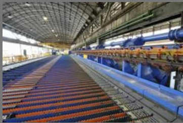
Round Mill Cooling Bed TMT Bars