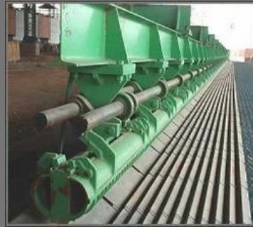
Cooling Bed System Twin Channels