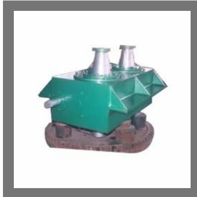
Rolling Mill Vertical Stands