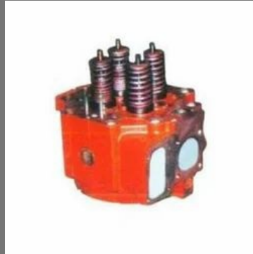
Marine Engine Steel Head