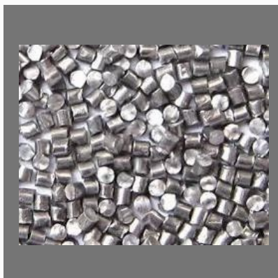
Aluminium Cut Wire Shots