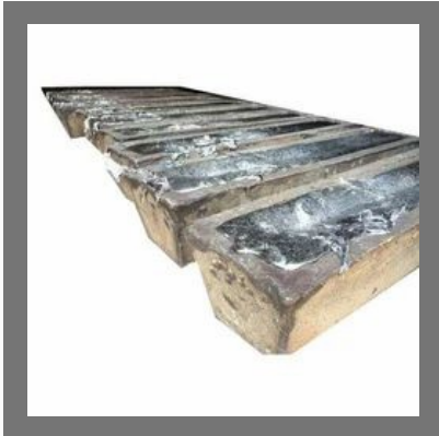
Aluminium Cast Ingot