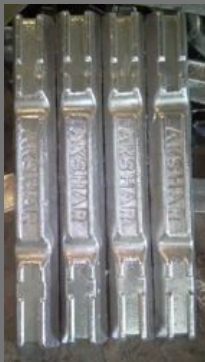
Aluminium Alloy ADC12