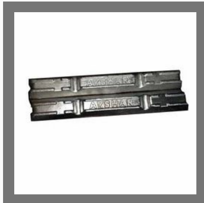
Aluminium Alloy Ingot