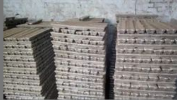
Aluminium Alloy LM6