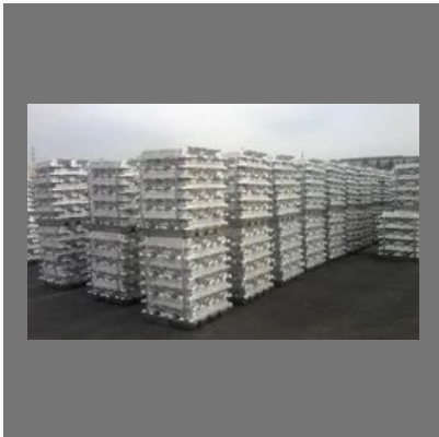
Industrial Aluminium Ingot