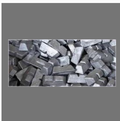
Aluminium Notch Bar