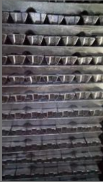
Aluminium Alloy LM9