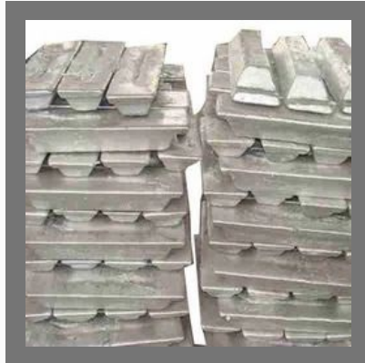
Secondary Aluminium Ingot