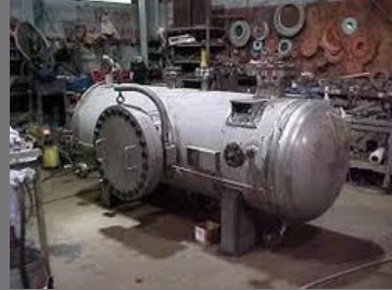
Pressure Vessels Tanks