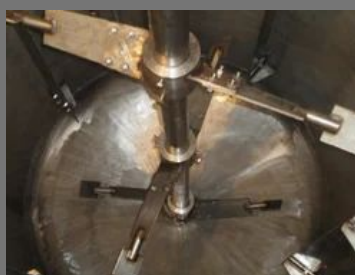
Cross Flow Impellers