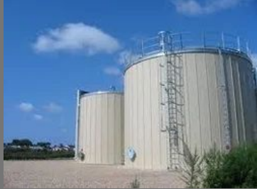
Vertical Storage Tanks