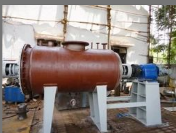
Rotary Vacuum Paddle Dryer