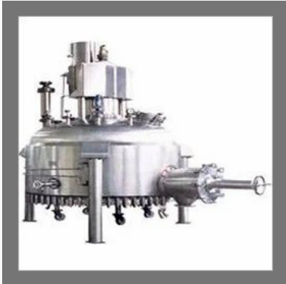
Agitated Nutsche Filter Dryer