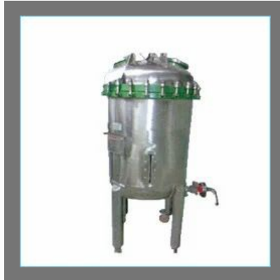
Vacuum Nutsche Filters