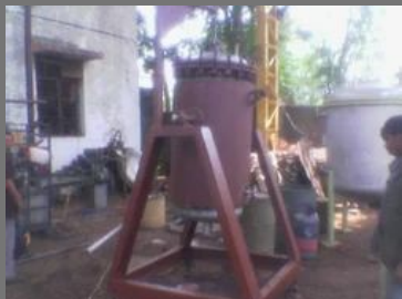
L Spiral Filter