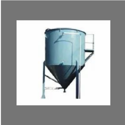
Pollution Control Devices