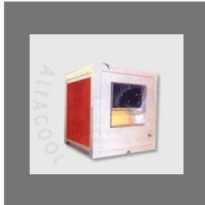
Air Washer And Its Spares