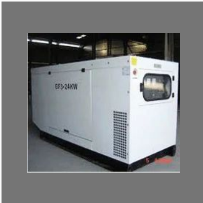
D.G. Sets Canopy