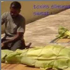
Leaf Bath Naturopathy Treatment