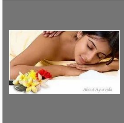
Kayakalpa or Rejuvenation Treatment