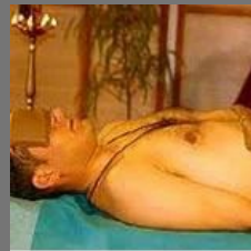
Mud Pack & Eye Pack