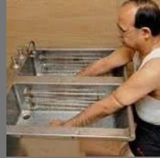
Hot Foot & Arm Baths