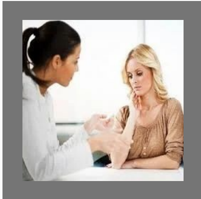
Counseling And Medical Advice