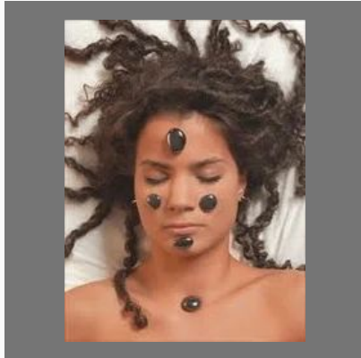
Treatment For Main Body And Soul