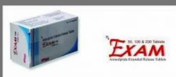
Amisulpride Extended Release