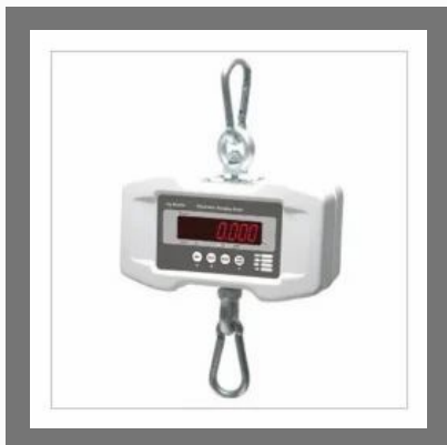
Mini Hanging Scale