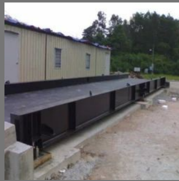
Pit Less Weighbridge