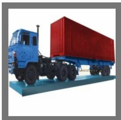
Electro Mechanical Weighbridges