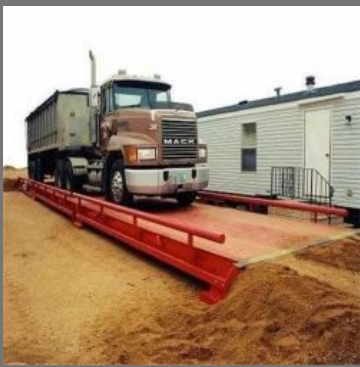
Electronic Road Weighbridge