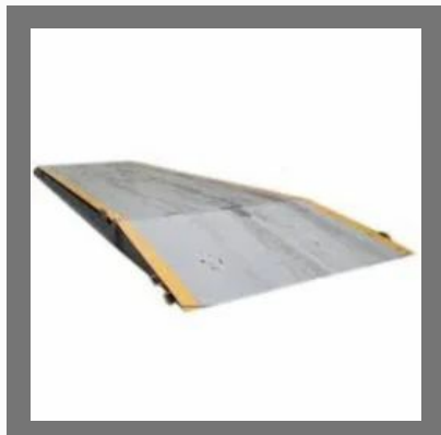
Mobile Weigh bridges