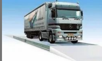
Truck Scale Weighbridge