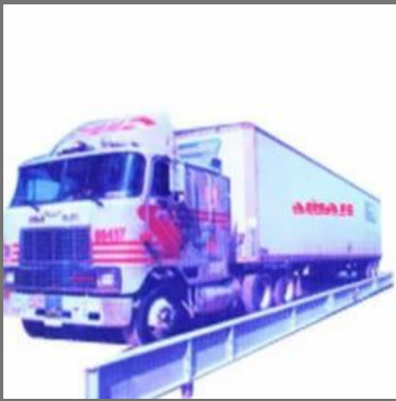
Electronic Truck Weighbridge