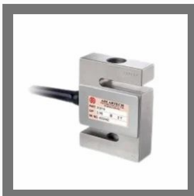
S Style Load Cell