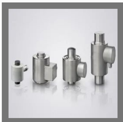
Customized Load Cell