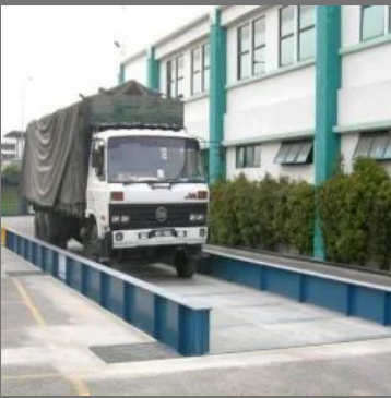
Industrial Pit Type Weighbridge