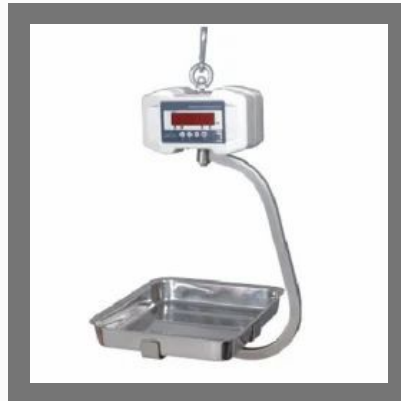
SS Hanging Scales