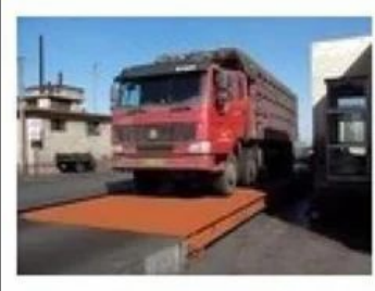
Electronic Pit Type Weighbridge