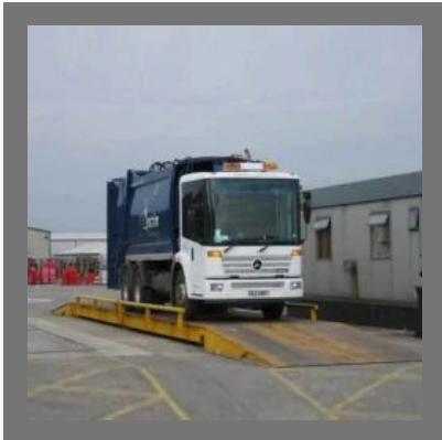
Industrial Weigh bridge