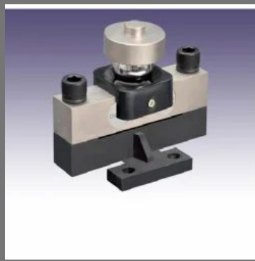
Weighbridge Load Cells