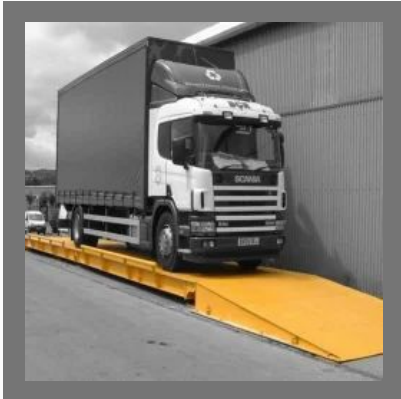
Highway Weighbridge for Industries