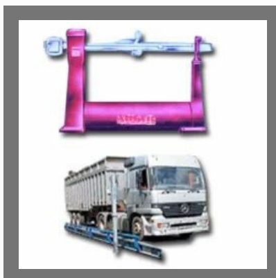
Mechanical Lorry Weighbridges