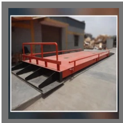
Modular Weigh bridge