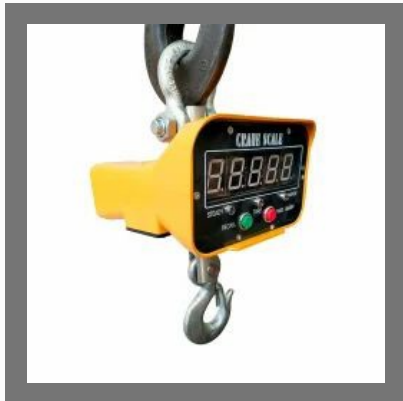
Portable Hanging Scale