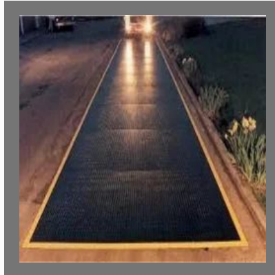
Highway Weigh bridge