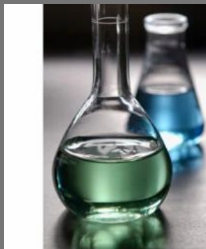
Catalyst For Water Treatment Polymers