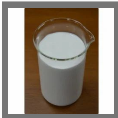
Polyvinyl Acetate Emulsion With Plasticizer