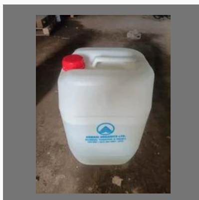
Methyl Ethyl Ketone Peroxide Mekp catalyst