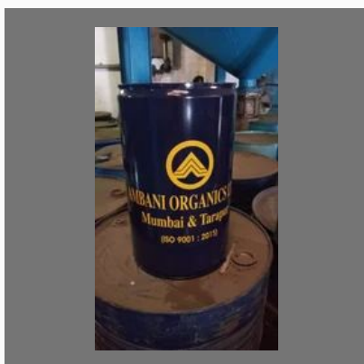
Calcium Octoate Paint Drier