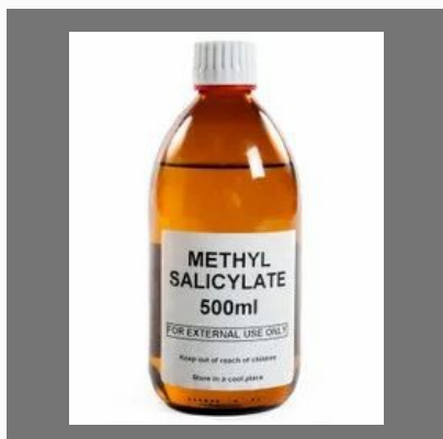
Methyl Salicylates Liquid