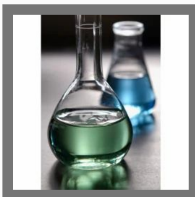
Self Cross Linking Pigment Binder