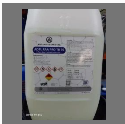
Tert Butyl Hydro Peroxide (TBHP)