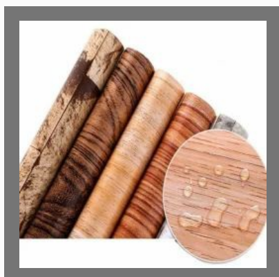
Water Proof Acrylic Emulsion