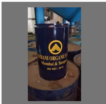
Zinc Octoate chemical