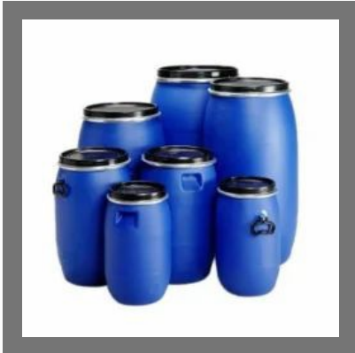
AOPL 308 Vinyl Acetate Acrylic Co Polymer