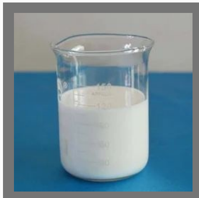
Silicone Defoamer Liquid