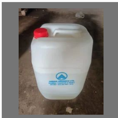
Tertiary Butyl Peroxy Benzoate