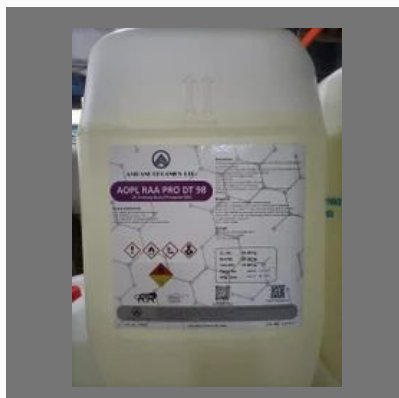
Di Tertiary Butyl Peroxide DTBP