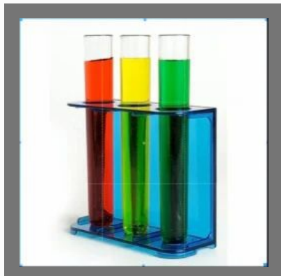
AOPL Dispersing Agent