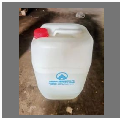
Tert Butyl Peroxy 2-Ethylhexyl Carbonate TBEC