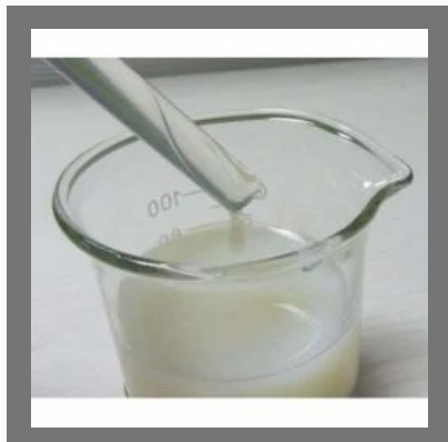
Styrene Acrylic Emulsion