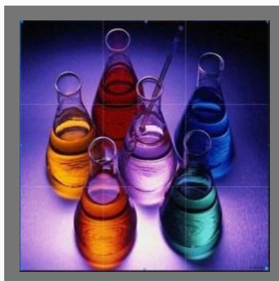
Pure Acrylic Polymer