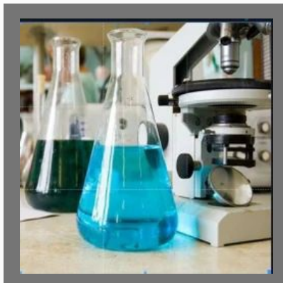
AOPL APL Acrylic Polymer Emulsion