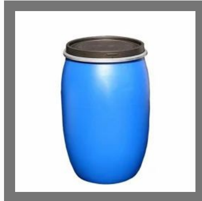
Bopp Lamination Adhesive