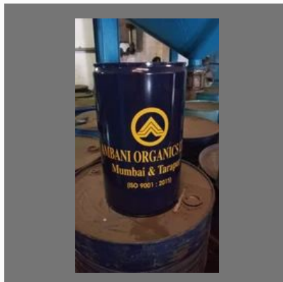
Manganese Octoate paint driers