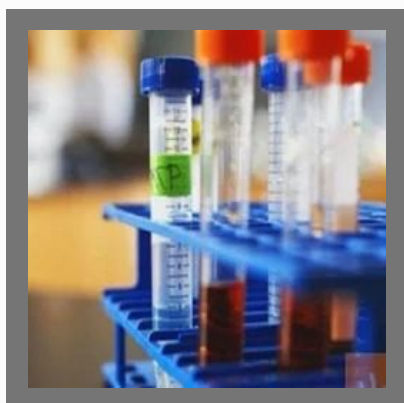
Acrylic Binder liquid