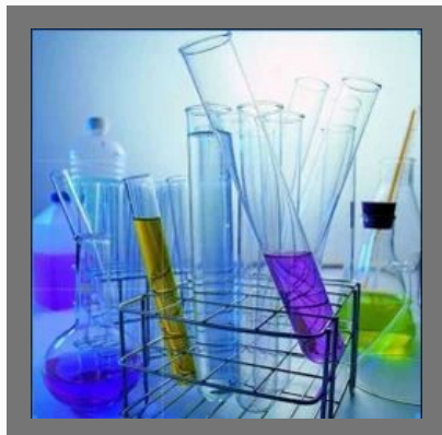
Self Cross Linking Extra Soft Acrylic Binder