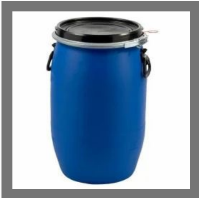
BOPP Lamination Adhesive