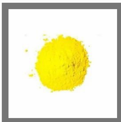
Self Thickening Binder