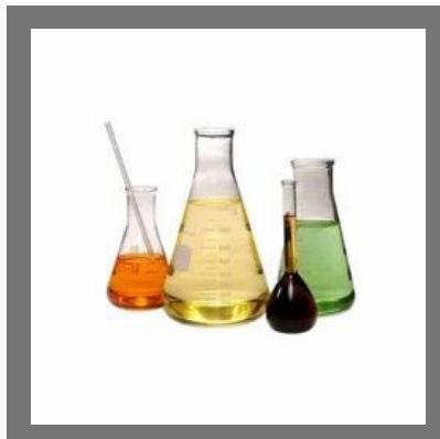
Self Cross Linking Extra Acrylic Emulsion