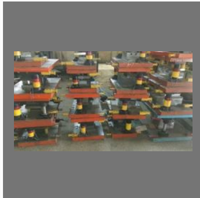
Press Tool Dies