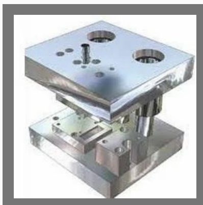
Sheet Metal Dies