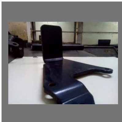
Auto Press Components