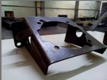
Auto Press Components