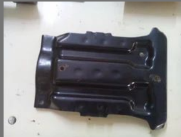
Auto Press Components