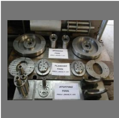
Press Tool Dies