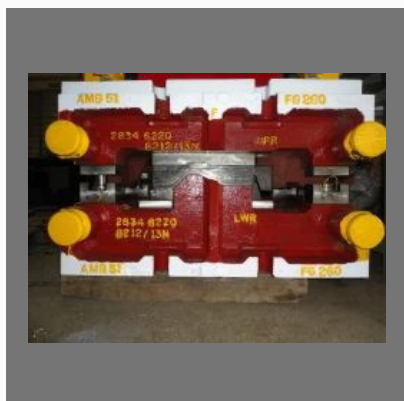
Press Tool Dies