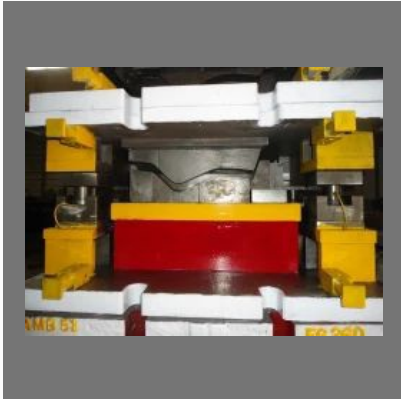
Press Tool Dies