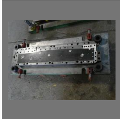
Press Tool Dies