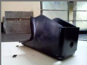
Auto Press Components