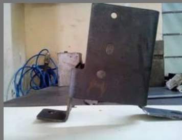
Auto Press Components