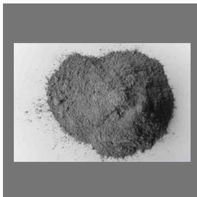
Zinc Dust Powder