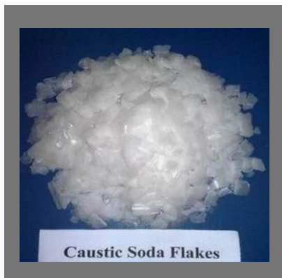
Caustic Soda Flakes