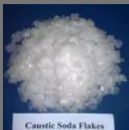
Caustic Soda Flakes

Amit Enterprise is an outstanding entity broadly involved in manufacturing, service providing and supplying a superlative array of products including Basic Chemicals, Imitations Jewelry and Barrel Plating Services.