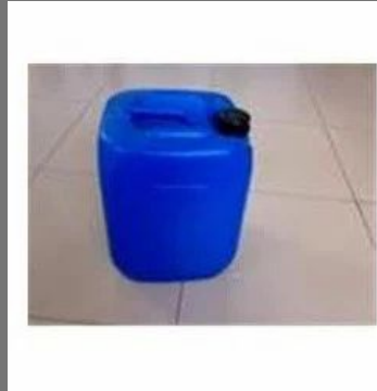
Nickel Additives and Brighteners