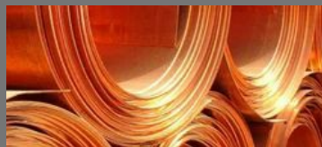
Non Ferrous Metals