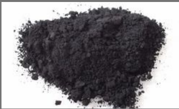
Black Carbon Powder