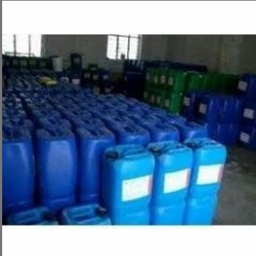
Lacquers and Dyes