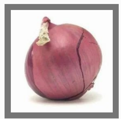
Red Color Onion