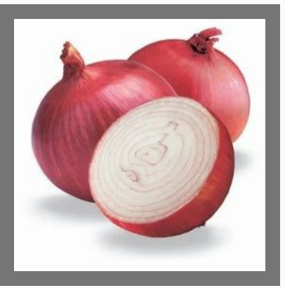
Fresh Red Onions