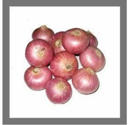
Red Onions (Two Inch I Diameter)