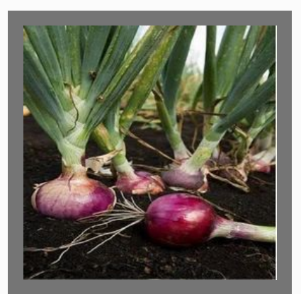
Small Red Onions