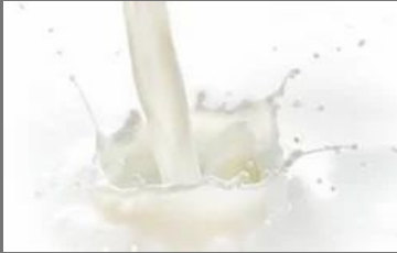
UHT Dairy Milk