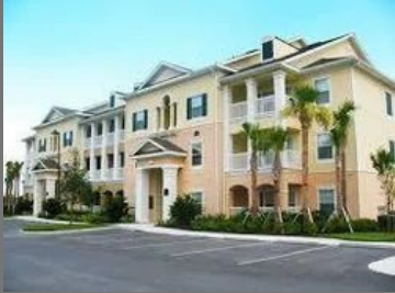
Group Housing Complexes