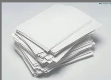
Writing and Printing Paper