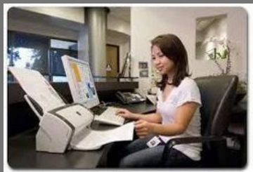
Business Advisory Services