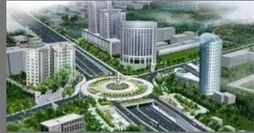
Development Of Residential Township