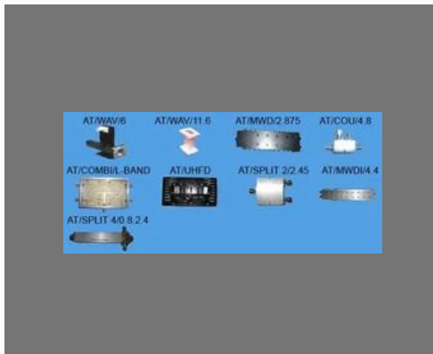
High Q Cavity Filters/Diplexers/Couplers/Waveguide Adapter