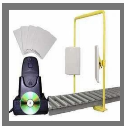
RFID Card Readers