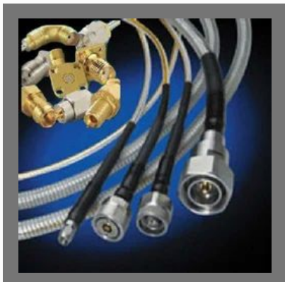
RF Cable Assemblies & Connectors