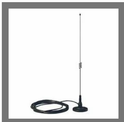
High Gain Antenna