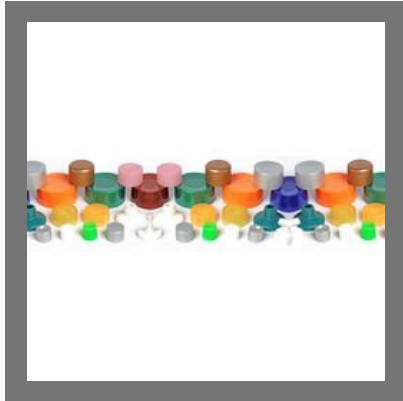
Injection Moulding Articles