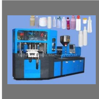
Plastic Blow Moulding