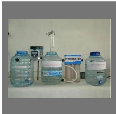
Domestic De-Fluoridation Water Filters