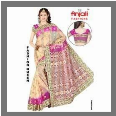
Fashion Embroidered Sarees