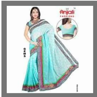
Exclusive Ethnic Sarees