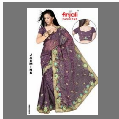
Fancy Party Wear Sarees