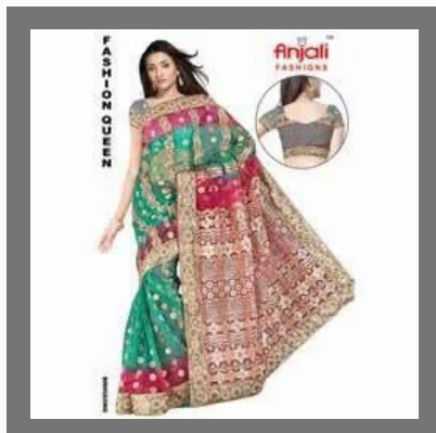
Embroidery Work Sarees