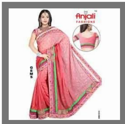
Ethnic Printed Sarees