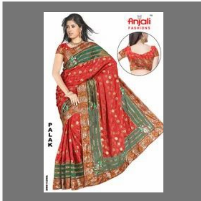
Designer Fashion Sarees