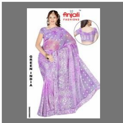
Fancy Wedding Sarees