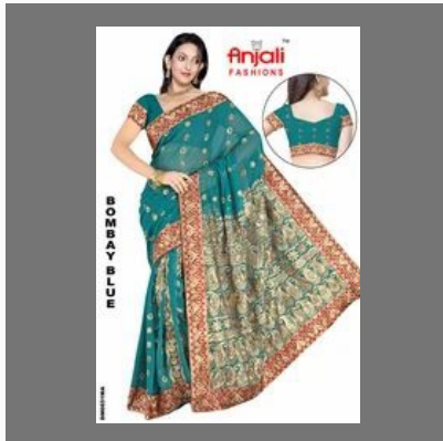
Printed Party Wear Sarees