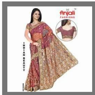
Shimmer Embroidered Sarees