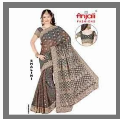
Net Designer Sarees