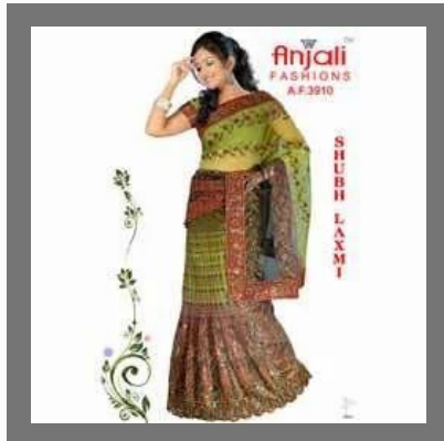
Silk Embroidered Sarees