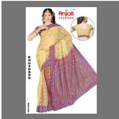
Laser Embroidered Sarees