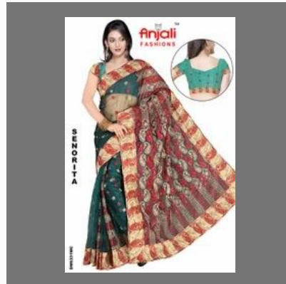
Net Wedding Sarees