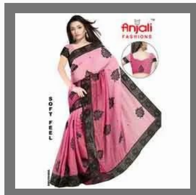
Ethnic Georgette Sarees