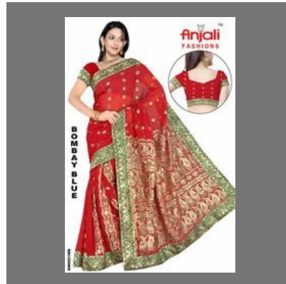
Party Wear Sarees