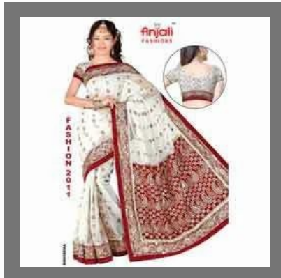
Sequin Work Sarees