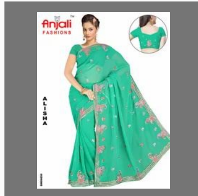
Party Wear Sarees