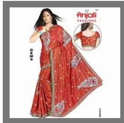
Sequin Embroidered Sarees