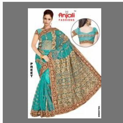
Designer Wedding Sarees