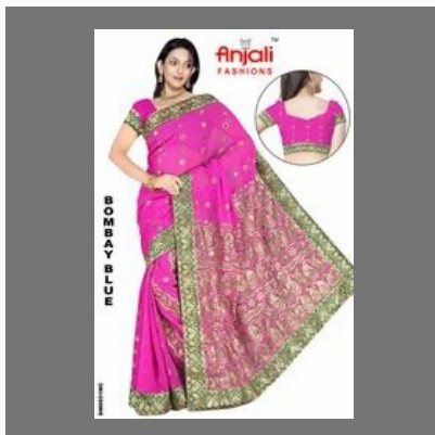
Designer Party Wear Sarees