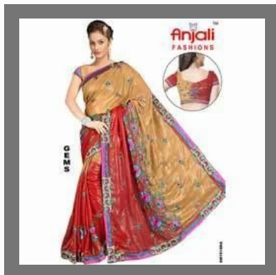
Floral Designer Sarees