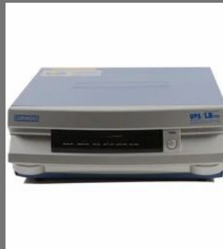
Luminous Digital Inverter