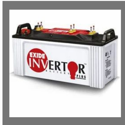
Exide Inverter Battery