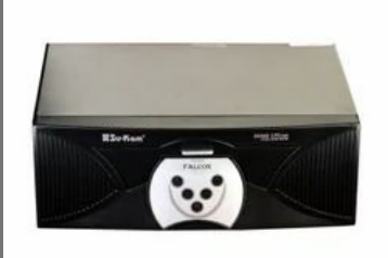
Sukam Digital Inverter