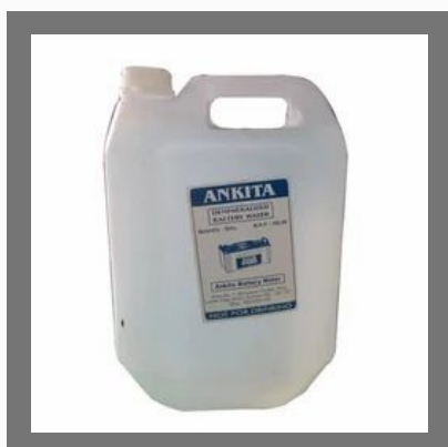
Demineralized Battery Water