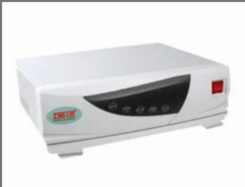
Digital Home Inverter