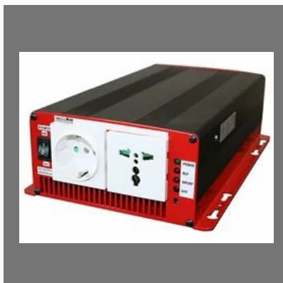
Heavy Duty Inverter