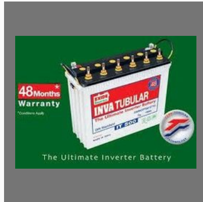
Exide Tubular Battery