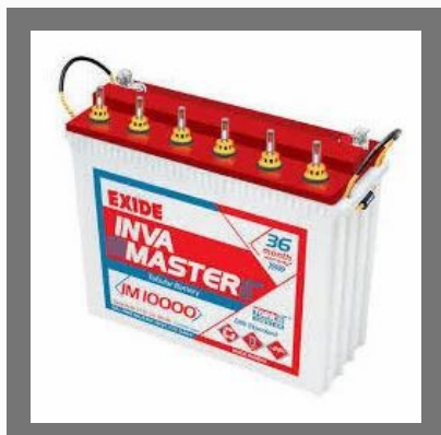
Exide Tubular Battery