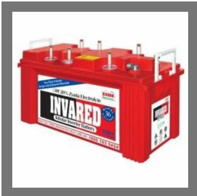
Exide Tubular Battery