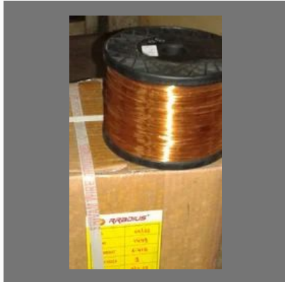
Self Solderable Copper Wire Class F