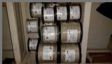
Fibre Glass Cables