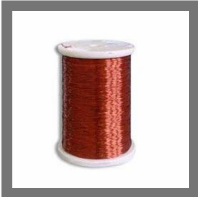
Super Fine Enameled Copper Wire