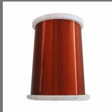
Dual Coated Enamel Copper Wire