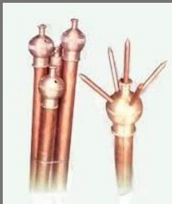
Copper Lighting Arrester