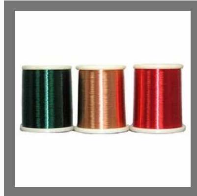
Polyurethane Copper Winding Wire