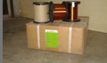
Class H Enameled Copper Wire