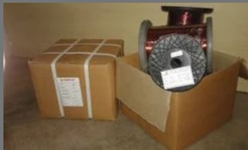
Class F Enameled Copper Wire