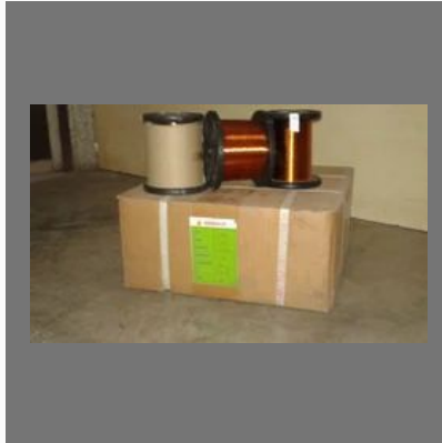
Enameled Copper Dual Coated Wire