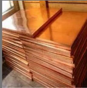
Copper Earthing Plate