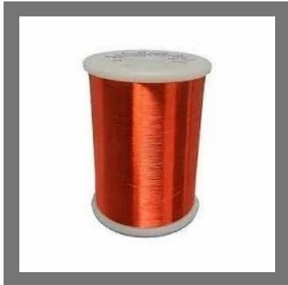
Class H Self Solderable Copper Wire