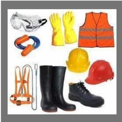
Industrial Safety Products