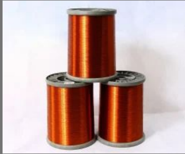
Copper Winding Wire