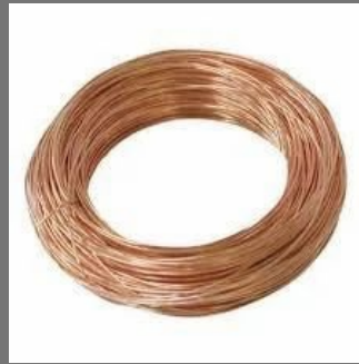
Bare Copper Wire