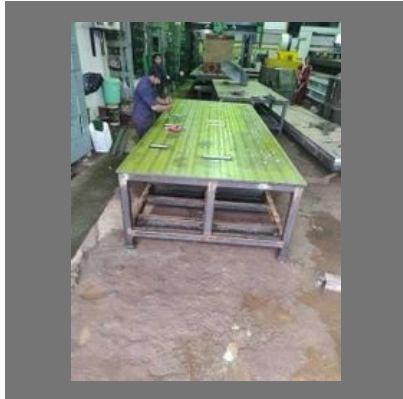
VMC Machining Service, Material - Aluminum