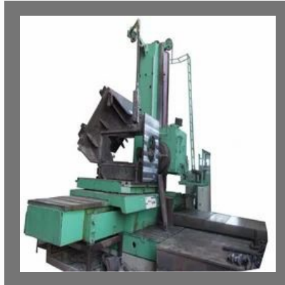
Floor Boring Machine with Rotary Table Job Work