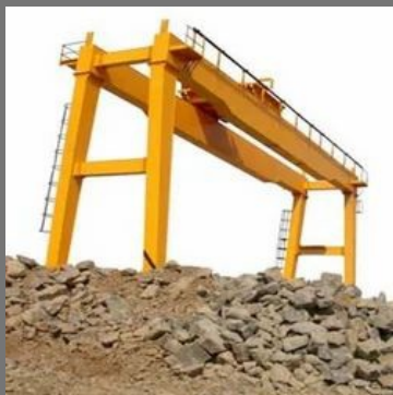
Industrial Crane Fabrication