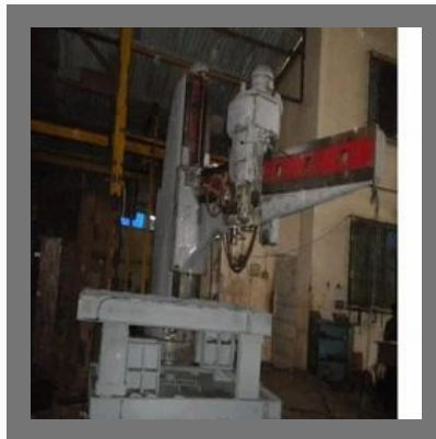
Drilling Machine Job Work