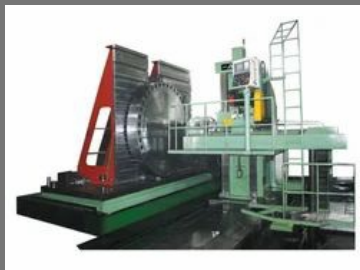
Tube Sheet Drilling Service