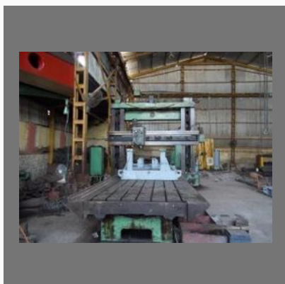
Double Column Plano Milling Job Work