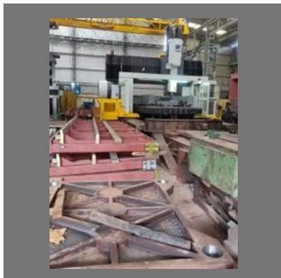
Metal Frame Fabrication