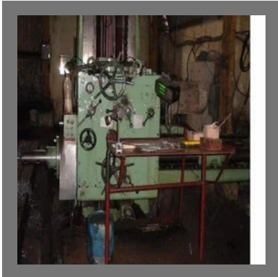
Horizontal Boring Machine Job Work