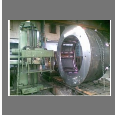
Floor Boring Machine Job Work