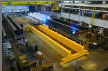
Crane Structures Fabrication