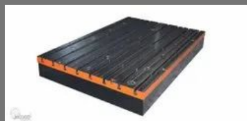
Cast Iron T Slotted Floor Plates