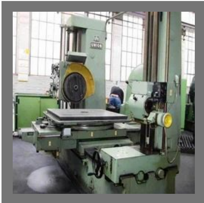
Boring Machine Job Work