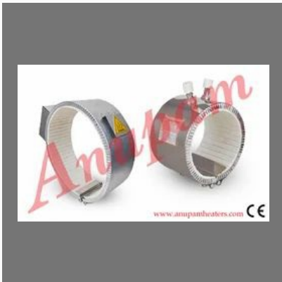
Ceramic Band Heaters