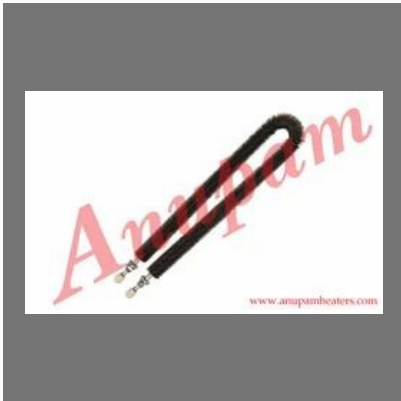
Finned Tubular Heater