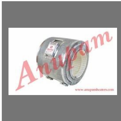
Energy Saving Band Heaters