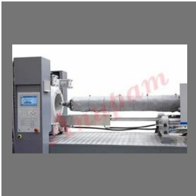
Insulation Energy Saving Jackets