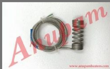
Micro Tubular Coil Heater