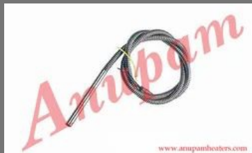
Low and Medium Watt Density Cartridge Heaters