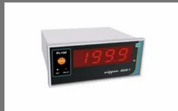
Digital Temperature Controller