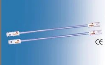
Medium Wave Quartz Infrared Heater