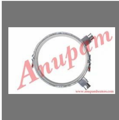
Ceramic Die Heaters