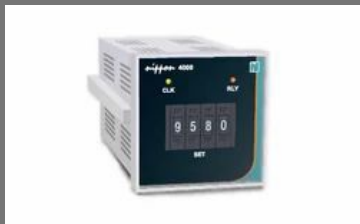
Preset table Timer