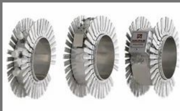
Heating Cooling Fins for Band Heaters