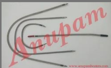
Flexible Tubular Heater