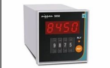
Digital Presettable Counters