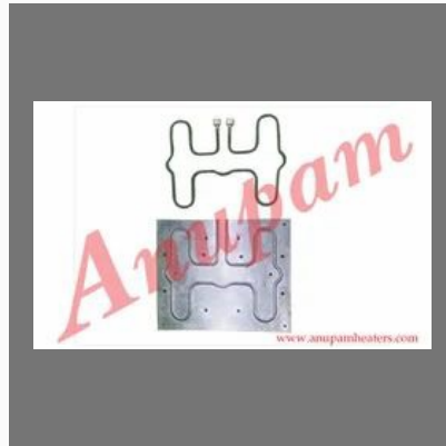
Tubular Heaters for Manifold