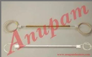
Short Wave Quartz Infrared Heater