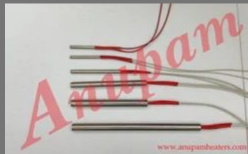
High Density Cartridge Heaters