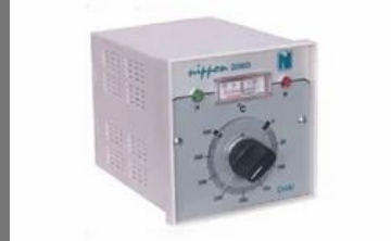
Analog Temperature Controller