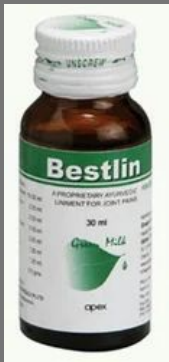
Bestlin Massage Oil