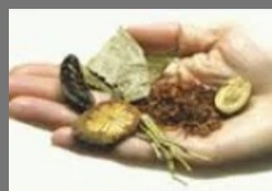
4Blud Herbal Drugs