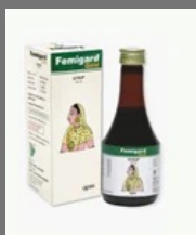
Femigard Gold Herbal Syrup