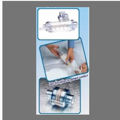
Aero Vent CHC