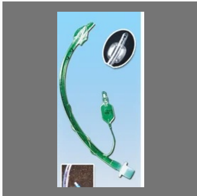
Eco Endotracheal Tubes