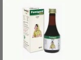
Femigard Gold Syrup