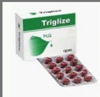
Trigize Herbal Tablets