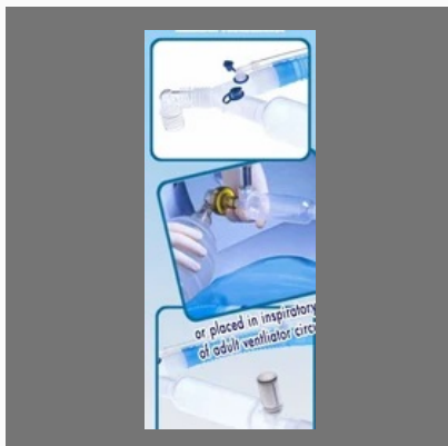
Mechanical Ventilator Holding Chamber