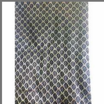
Fancy Jacquard Brocade