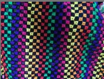
Embroidery Garment Fabric