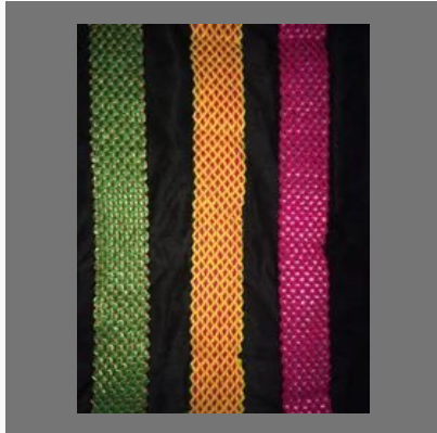
Saree Border Lace