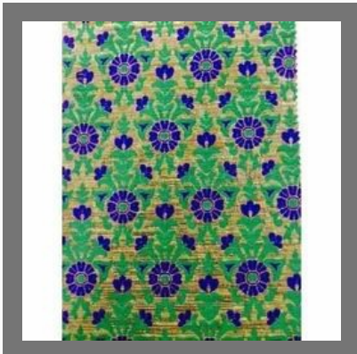
Fancy Jacquard Fabric