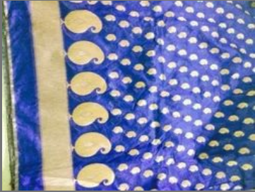
Exclusive Jacquard Fabric