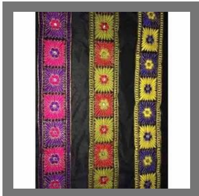
Embroidery Border Lace