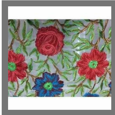
Latest Embroidery Fabric