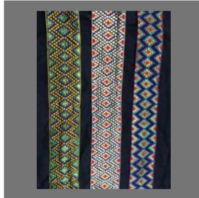
Fancy Border Lace