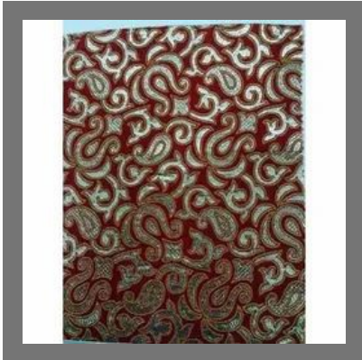
Jacquard Garment Brocade