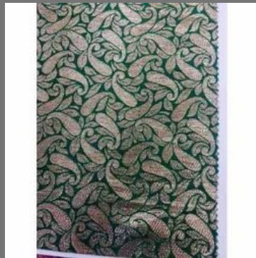
Jacquard Brocade Fabric