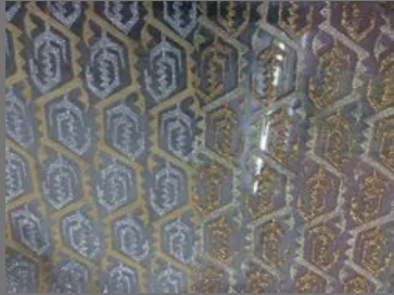
Embroidery Designer Fabric