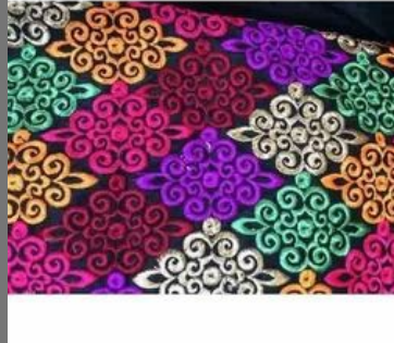
Fancy Embroidery Fabric