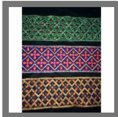
Embroidery Border Lace