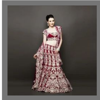
Designer Bridal Lehenga