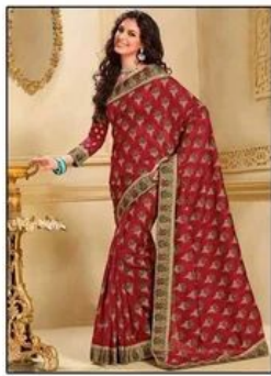
Designer Silk Sarees