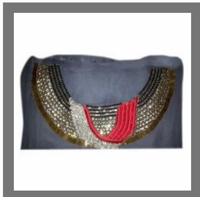
Designer Neck Patches