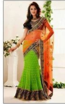
Designer Lehenga Sarees