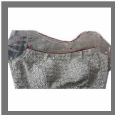
Net Fabric Designer Blouse