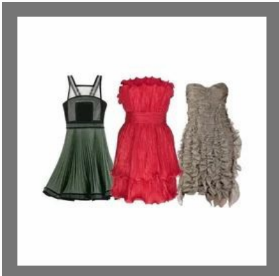
Designer Western Dresses