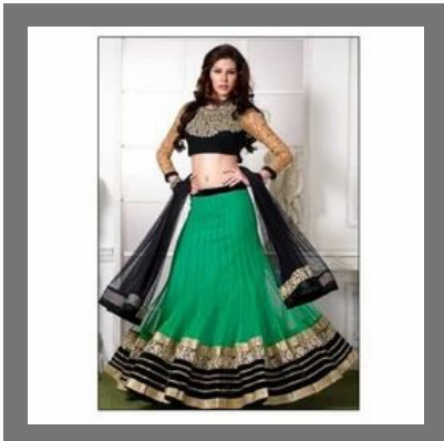
Trendy Designer Lehenga