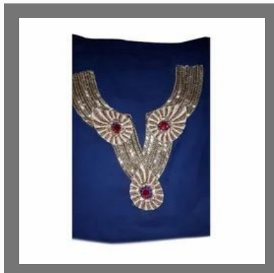
Handmade Neck Patches