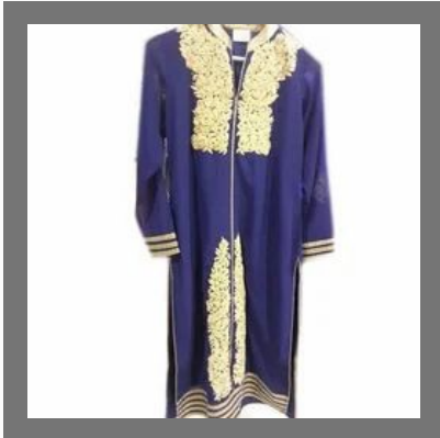
Ladies Designer Suits