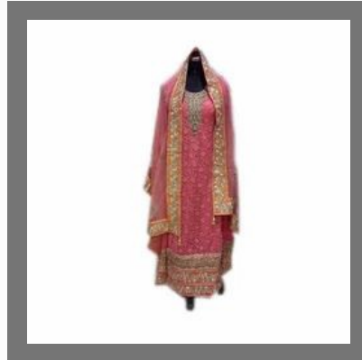
Embroidered Designer Suits