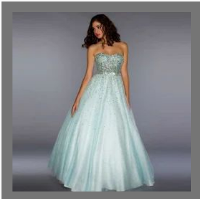
Custom Design Gown