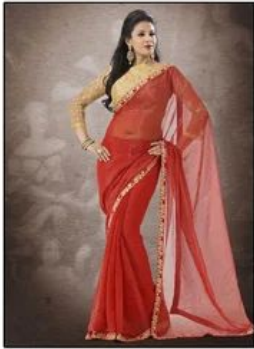
Designer Georgette Sarees