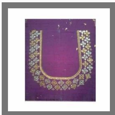
Suit Neck Patches