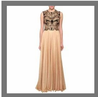
Indo Western Gown