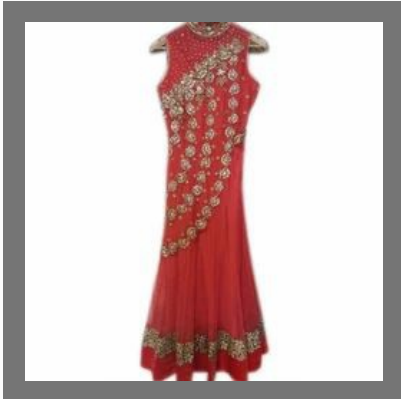
Party Wear Gown