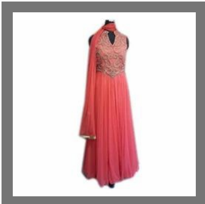
Long Anarkali Suits