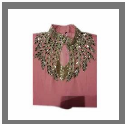
Ladies Dress Material