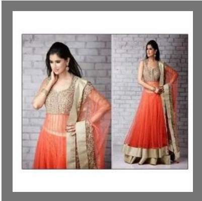
Party Wear Designer Lehenga