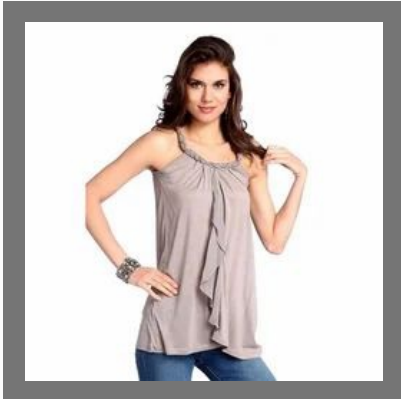
Casual Western Dresses