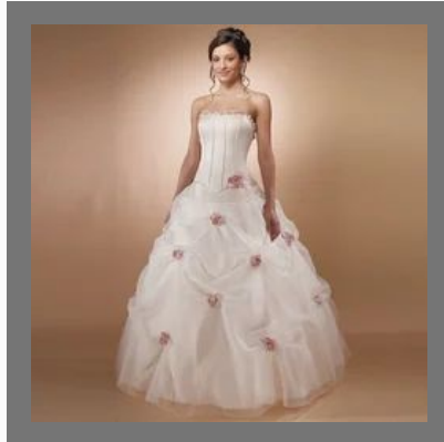
Designer Bridal Gown