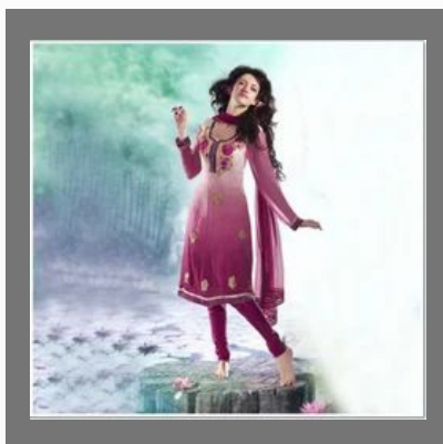
Party Wear Dress