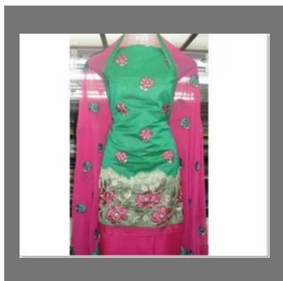
Printed Dress Material