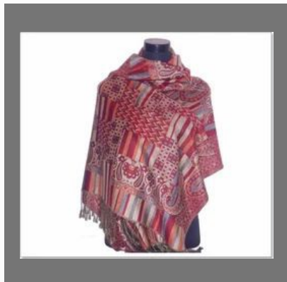
Fancy Ladies Shawls