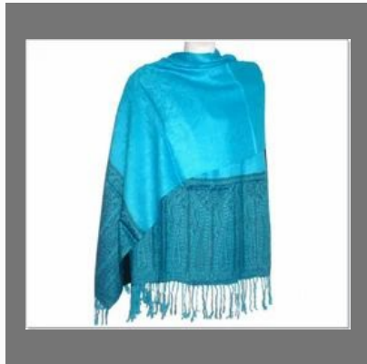
Plain Ladies Shawls