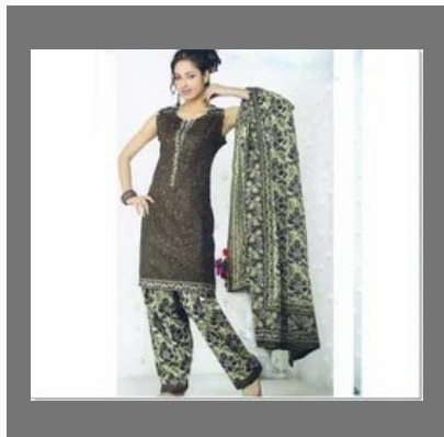
Ready Made Salwar Kameez