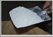
Castables & Ramming Mass