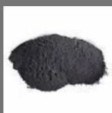
Ladle Covering Compound