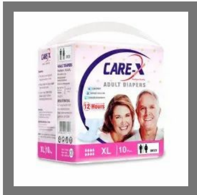
XL Adult Diapers