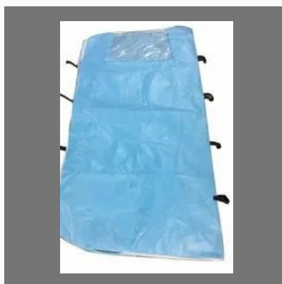
Dead Body Plastic Bag