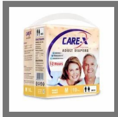
CARE-X Adult Diapers