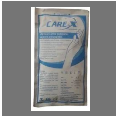
Care X Surgical Gloves