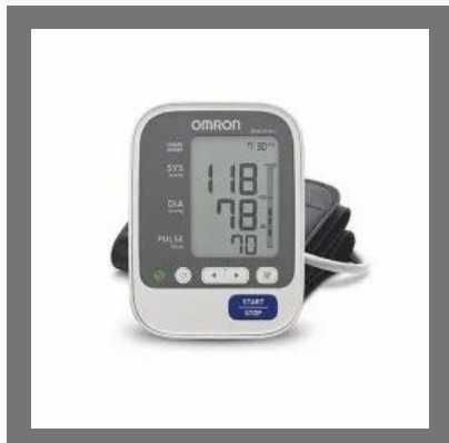
Omron HEM-7130-L Deluxe Blood Pressure Monitor