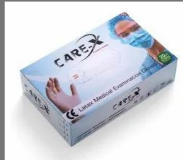
Non Sterile Latex Medical Examination Gloves