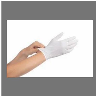
Medical Latex Gloves