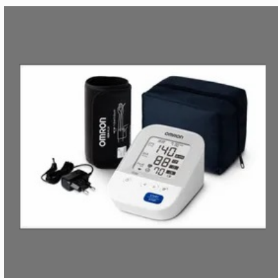
Omron HEM-7156-A Blood Pressure Monitor