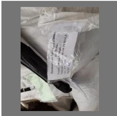
Powdered Latex Exam Gloves