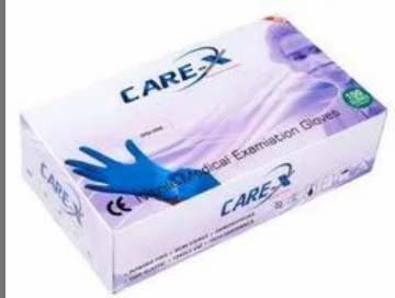
Nitrile Medical Examination Gloves