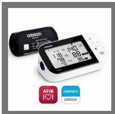
Omron HEM-7361T Automatic Blood Pressure Monitor