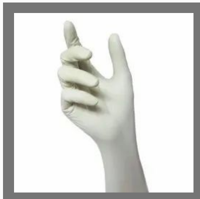
White Latex Examination Gloves