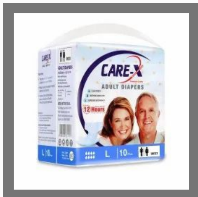
L Size Adult Diaper