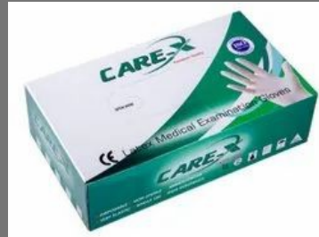
Single Use Latex Medical Examination Gloves