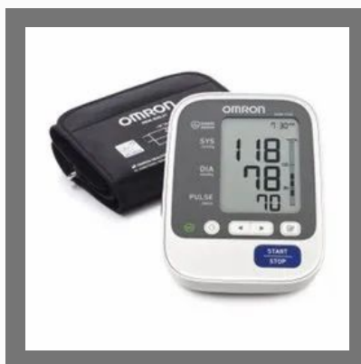
Omron HEM-7130 Deluxe Blood Pressure Monitor