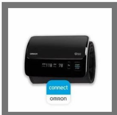
Smart Elite+ HEM-7600T Blood Pressure Monitor