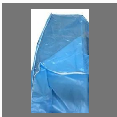
Disposable Body Bag