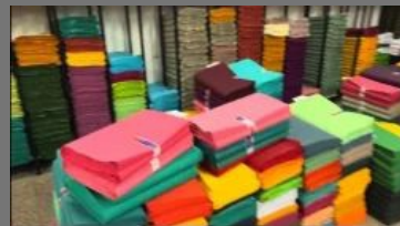
Terry Rubia Fabric