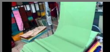
Cotton Lining Fabric