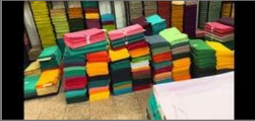
Cotton Voile Fabric