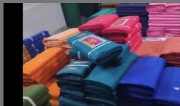
Cotton Aster Fabric