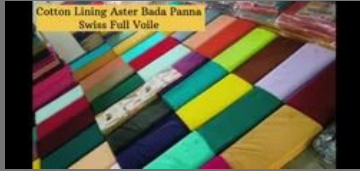
Cotton Lining Fabric