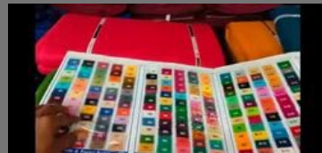
Cotton Voile Fabric