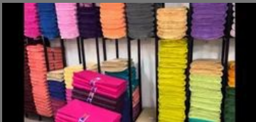
Cotton Rubia Fabric