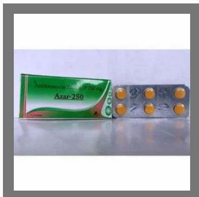
Azithromycin Tablet (Azar - 250)