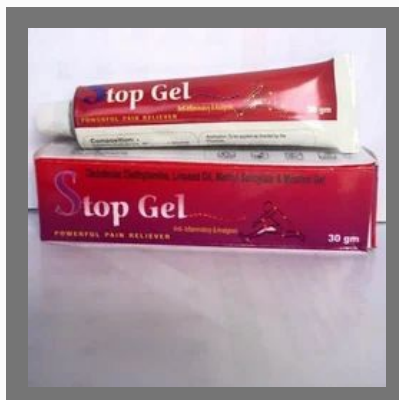
Pain Relieving Gel (Stop Gel)