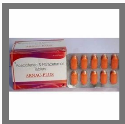
Arnac - Plus Paracetamol Tablets