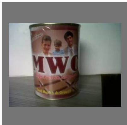
MWC High Protein Supplement