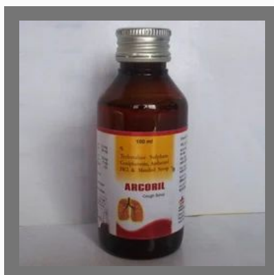
Cough Syrup (Arcoril)