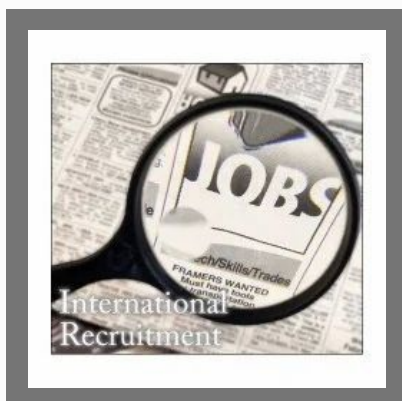
International Manpower Recruitment Services