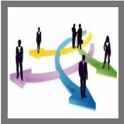
Human Resource Placement Services