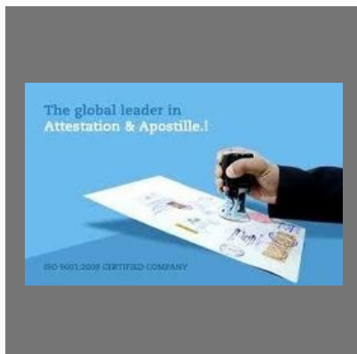
Documents Attestation Solutions