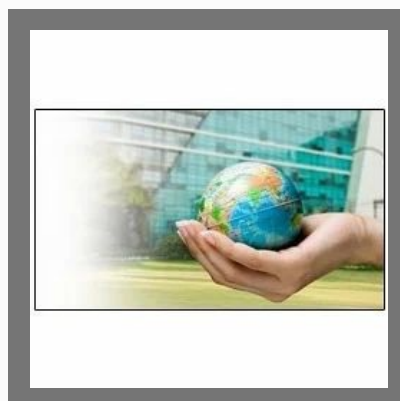
Visa Processing & Immigration Services