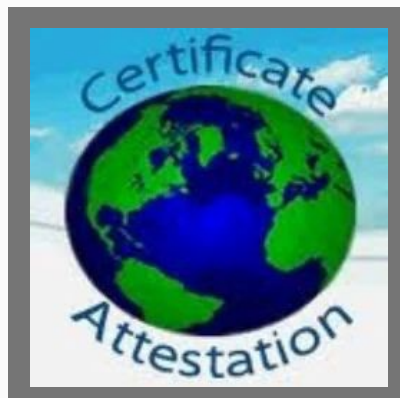
Certificates Attestation Services