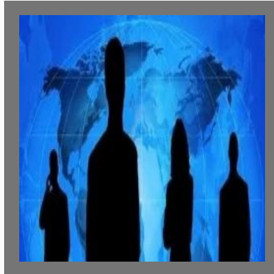
Executive Search Services