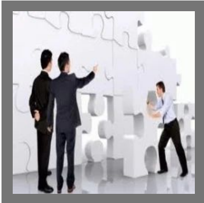
Human Resource Consultancy Services